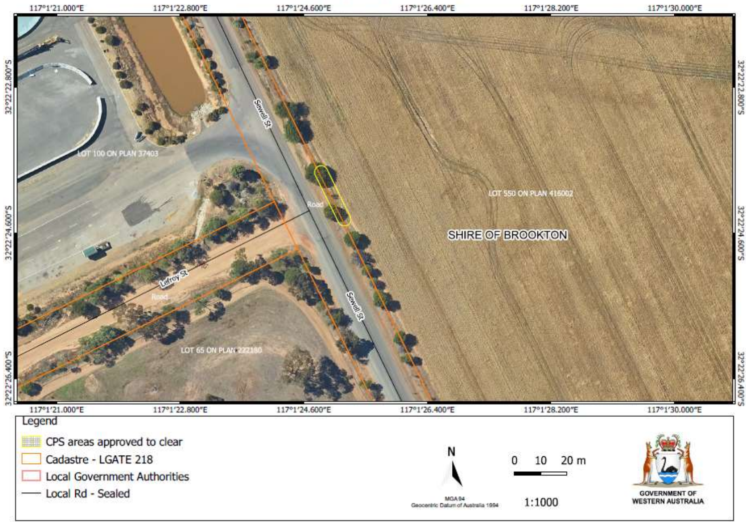
Figure 1.3: Map of the boundary of the area B within which clearing may occur