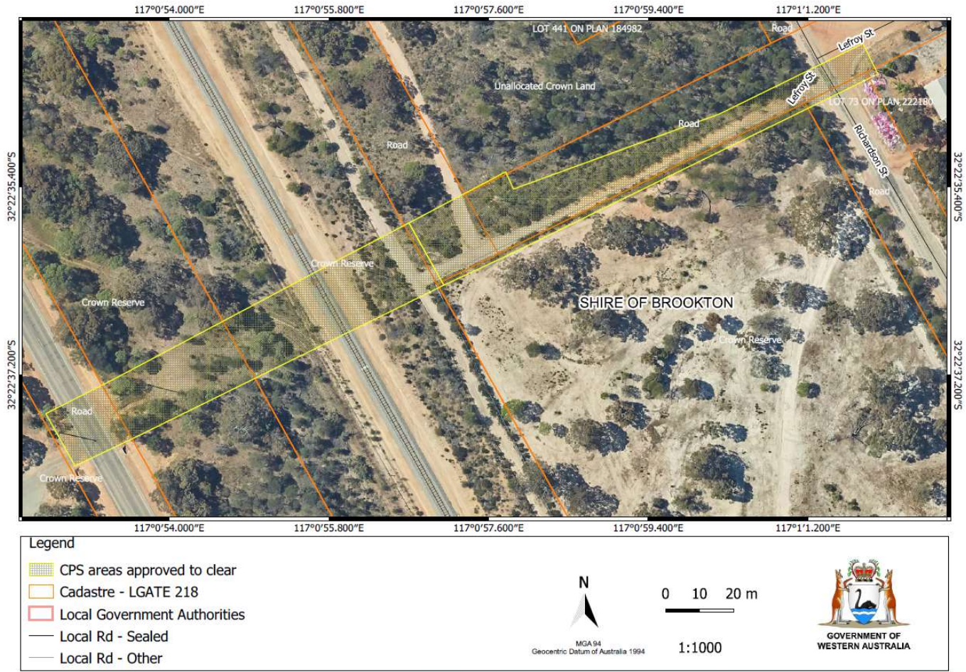
Figure 1.2: Map of the boundary of the area A within which clearing may occur