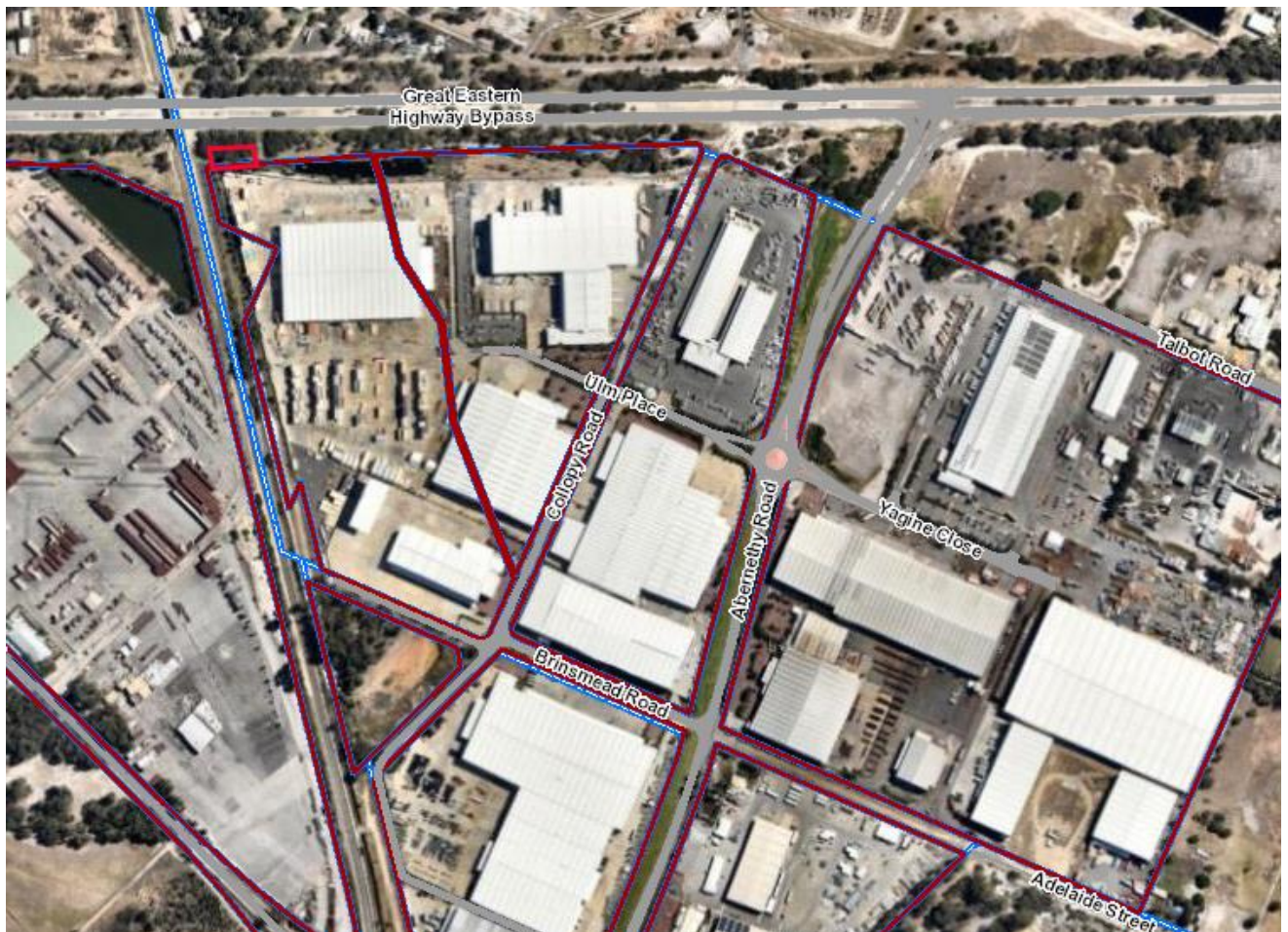
Aerial photograph of site (red polygon) and Great Eastern Highway Bypass