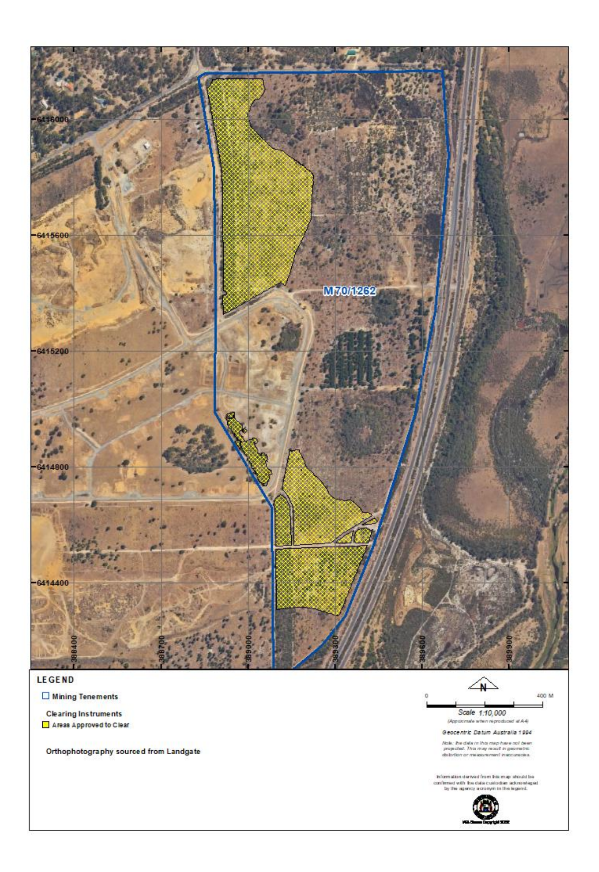
Figure 1: Map of the boundary of the area within which clearing may occur

The boundary of the area authorised to be cleared is shown in the map below (Figure 1).