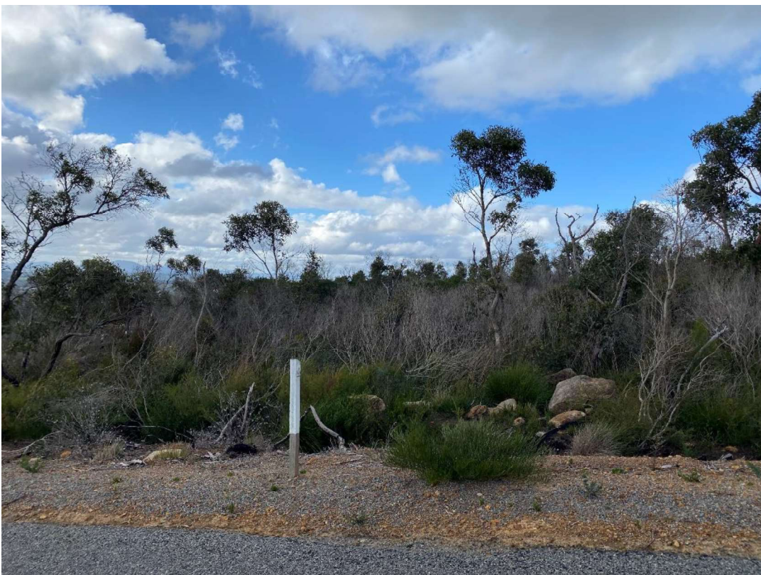
Photo 2: Photo indicating the kind of bushland that would be cleared for the trails