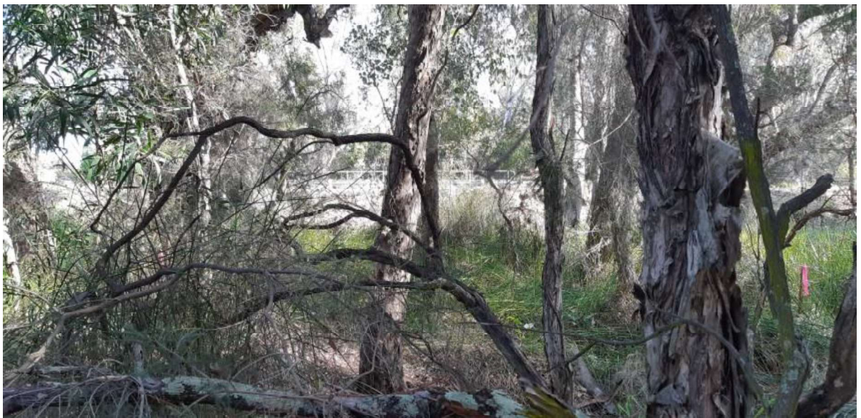
Figure 3: Photo facing west showing semi-mature and juvenile M. raphiophylla and L. longitudinale in background which will be removed to make way for the maintenance track.