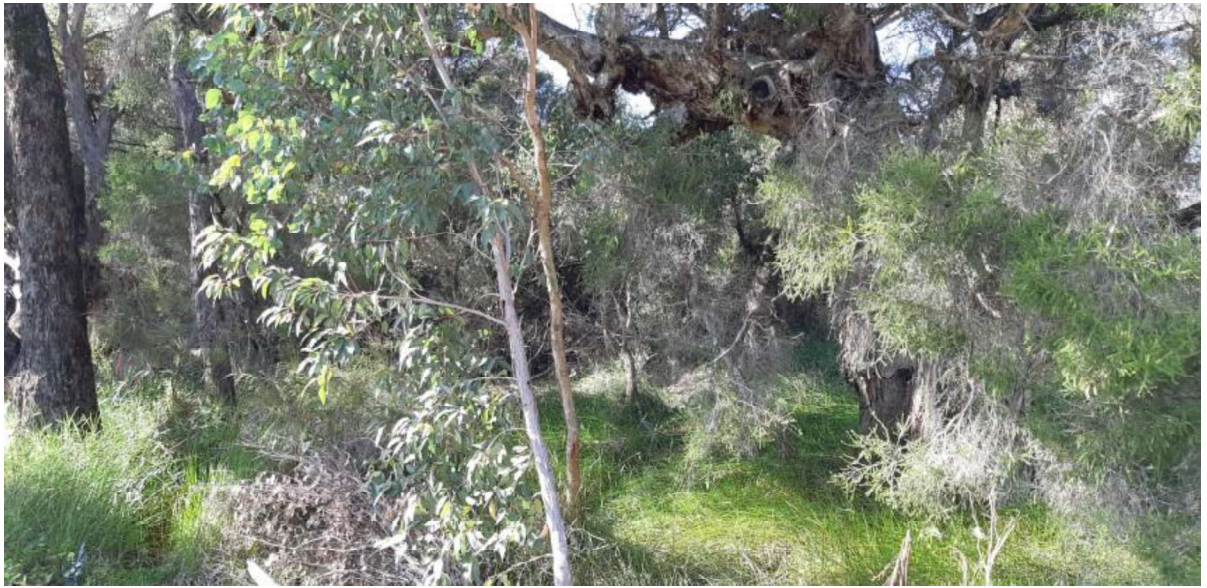
Figure 2: Photo facing east, showing large stand of L. longitudinale which will need to be removed along with the juvenile E. rudis .