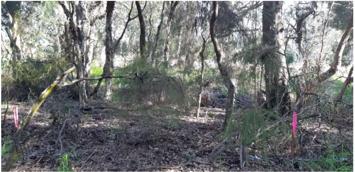
Figure 6: Photo showing semi-mature and juvenile M. raphiophylla which will be removed and mature E. rudis which was avoided due to track re-design.

All other vegetation which requires removal as part of these works, are exotic species (i.e. Acacia longifolia )