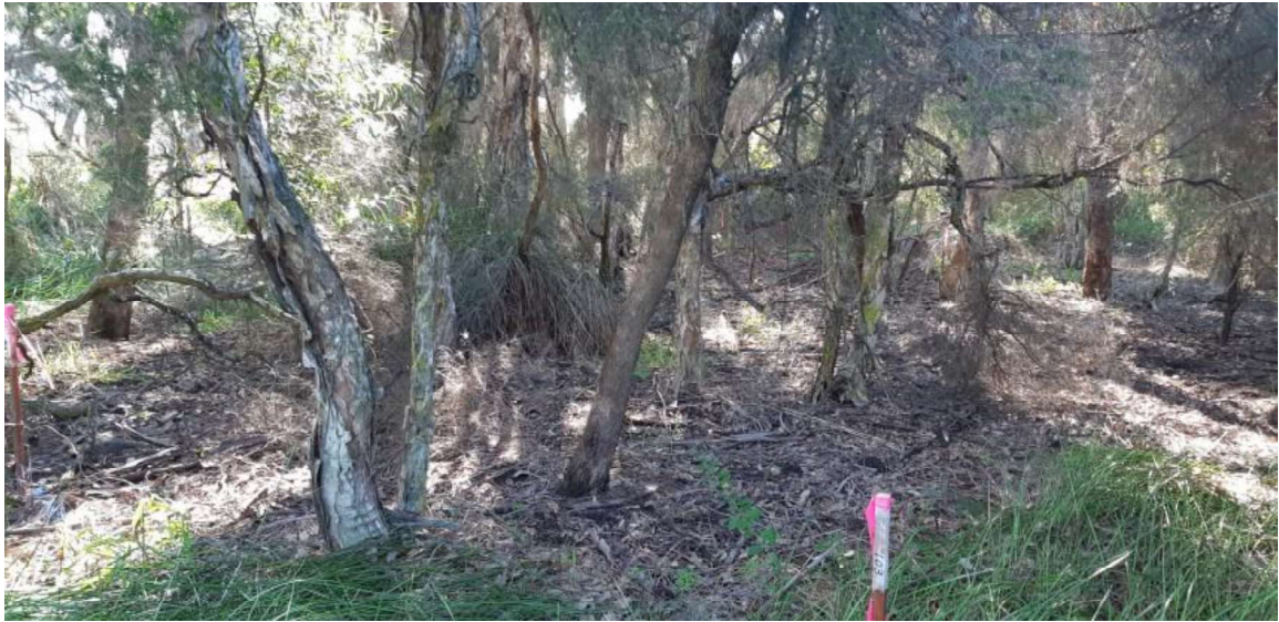
Figure 4&5: Photo showing semi-mature and juvenile M. raphiophylla and second mature E. rudis which will need to be removed. Limited understorey within footprint area in the background.