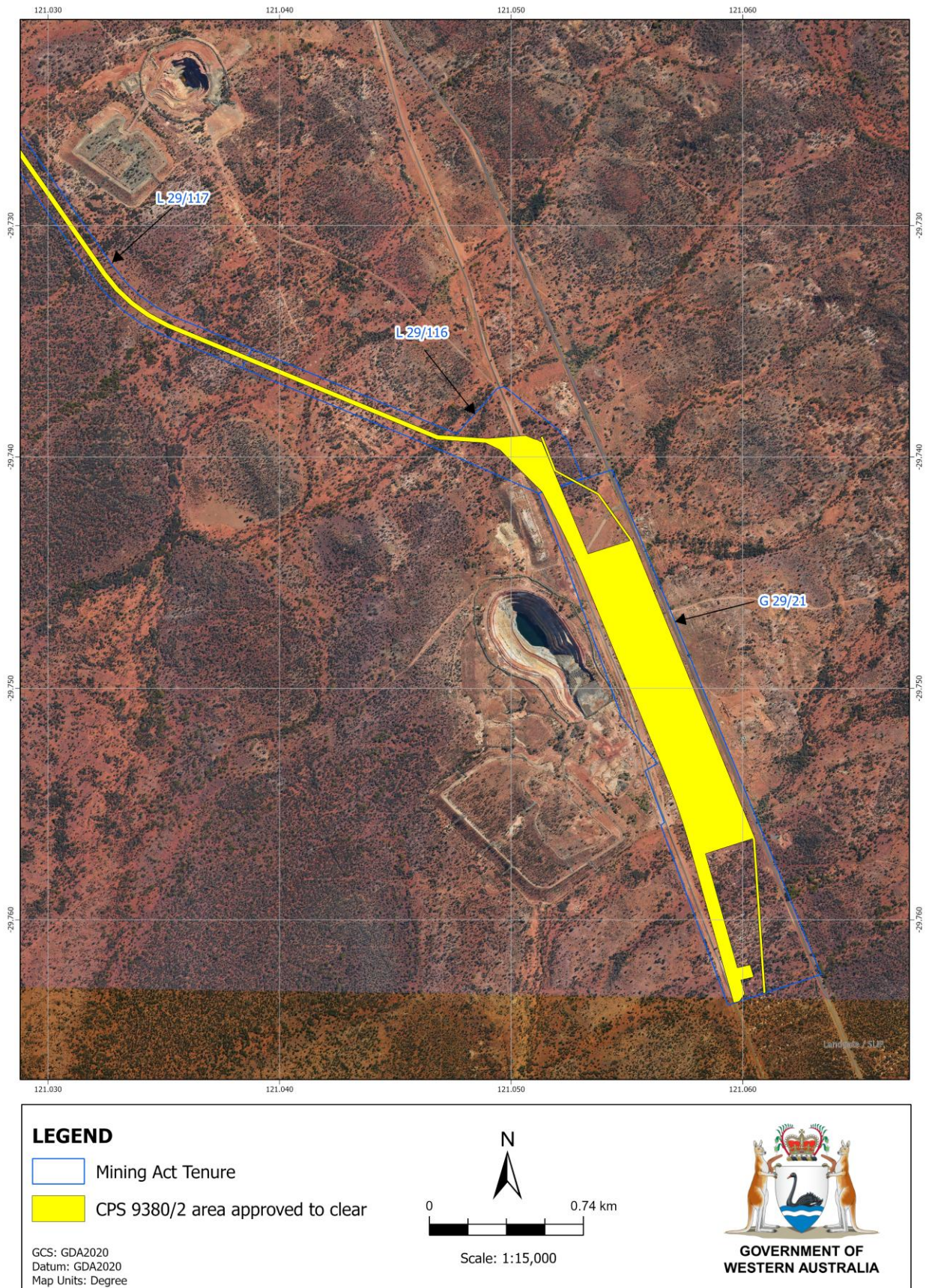
Figure 2: Map of the boundary of the area within which clearing may occur.