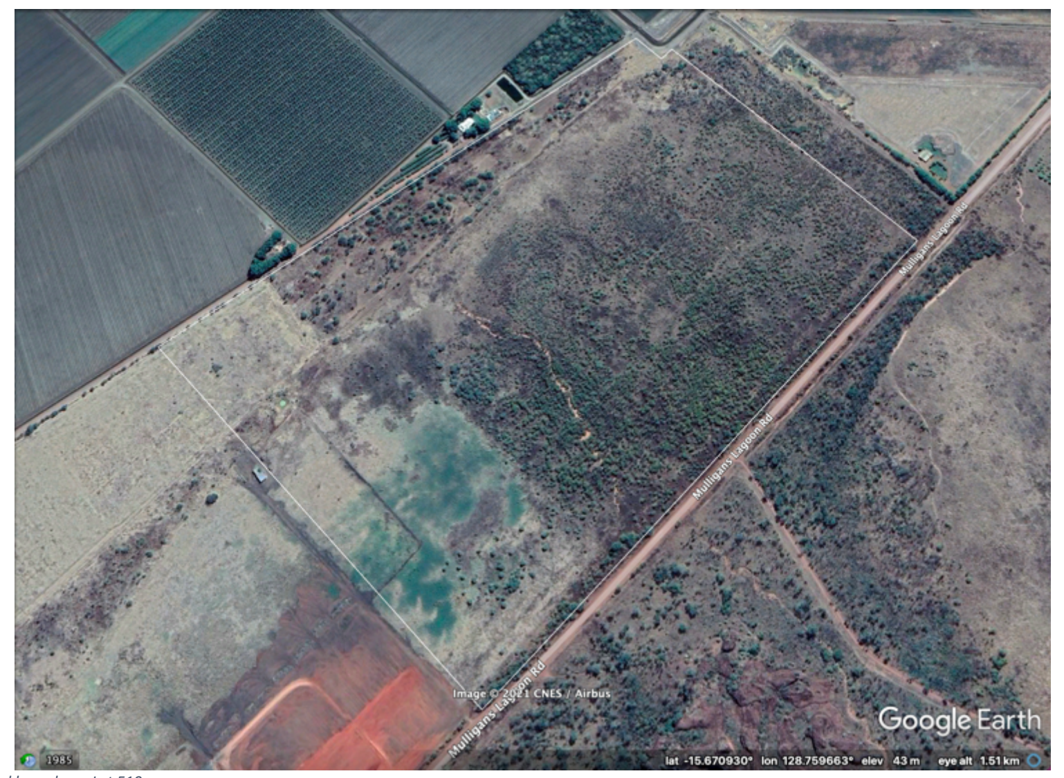
Figure 2 Cadastral boundary - Lot 510