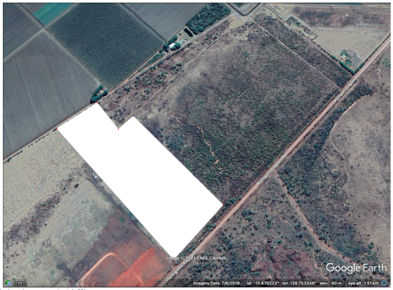
Figure 3 Previously cleared area: approximately 22ha