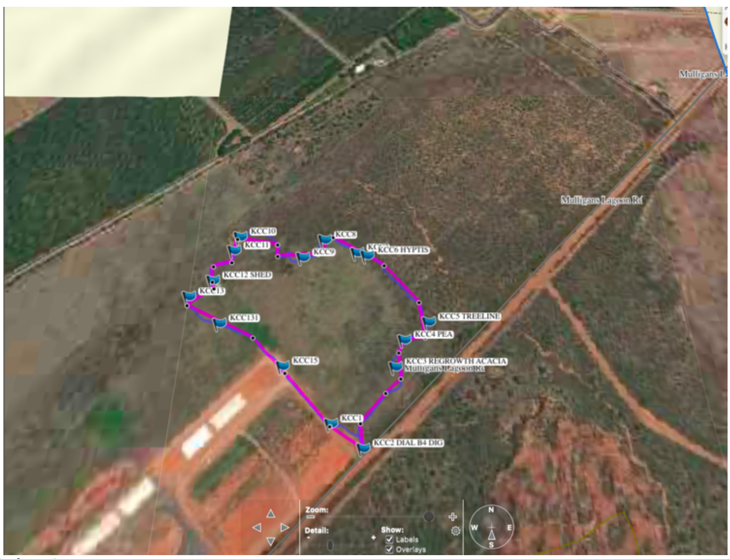
Figure 4 - Site walk reference image