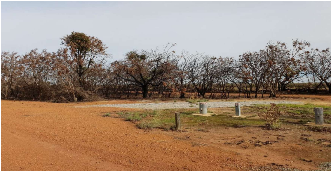
Gillingarra 5 – Vegetation to be cleared