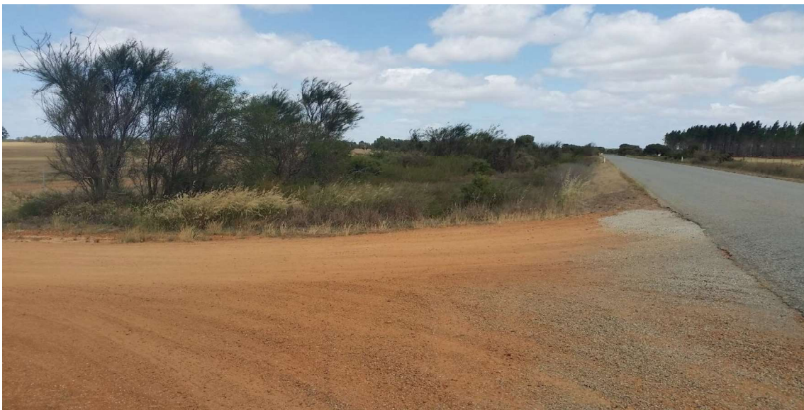
Gillingarra 7 – Vegetation to be cleared