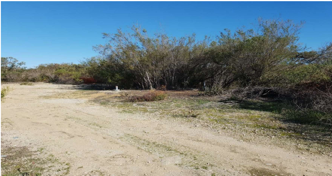
Gillingarra 2 – Vegetation to be cleared