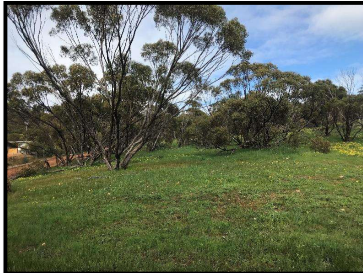
Plate 4: Wandoo over Trymalium odoratissimum and Melaleuca marginata on north-east breakaway

The vegetation in the main survey area on the hill was a mixture of Wandoo on the upper slopes and hilltop and Marri ( Corymbia calophylla ) on the hill top, particularly at the southern end. Some native understorey shrubs occurred on the north-east breakaway, including Trymalium odoratissimum and Melaleuca marginata (Plate 4). Other breakaways were very sparsely vegetated (Plate 5).