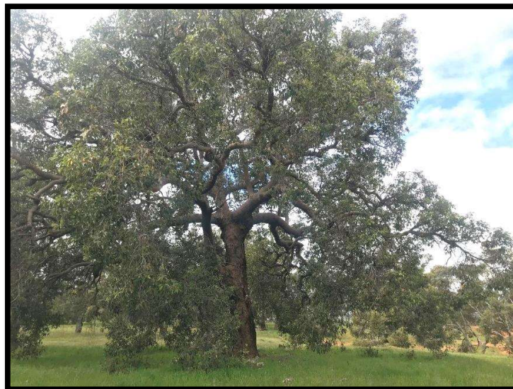
Plate 8: Additional Significant Marri Tree