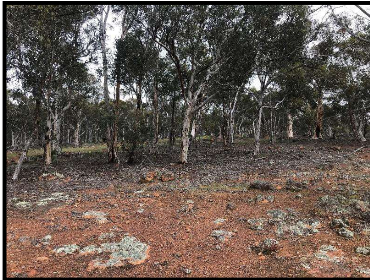
Plate 6: Wandoo over bare understorey on hill top

Very few native shrubs were observed on the hilltop (Plate 6 and 7).