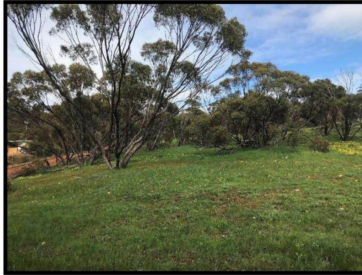
Plate 3: Wandoo and York Gum over weeds.

The vegetation in the main survey area on the hill was a mixture of Wandoo on the upper slopes and hilltop and Marri ( Corymbia calophylla ) on the hill top, particularly at the southern end. Some native understorey shrubs occurred on the north-east breakaway, including Trymalium odoratissimum and Melaleuca marginata (Plate 4). Other breakaways were very sparsely vegetated (Plate 5).