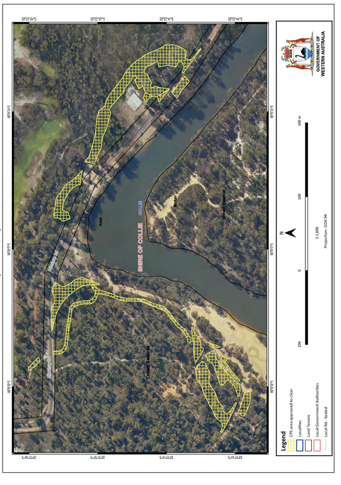
Figure 1: Map of the boundary of the area within which clearing may occur

The boundary of the area authorised to be cleared is shown in the map below (Figure 1).