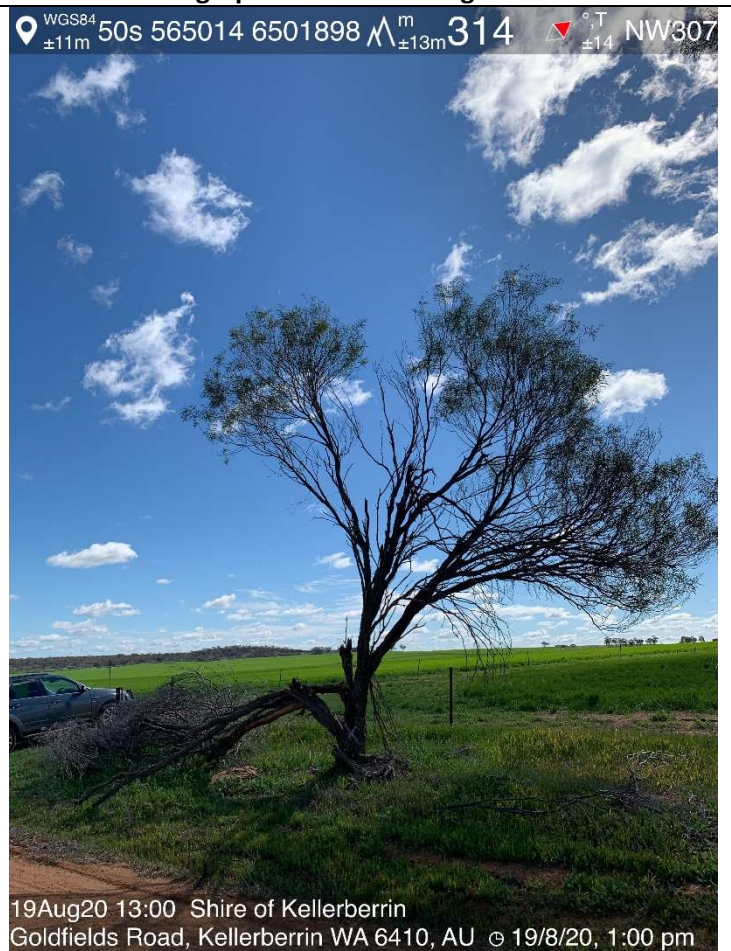
Photograph 80: Tree clearing ID GR-080