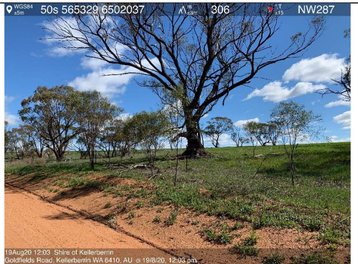
Photograph 78: Tree clearing ID GR-078