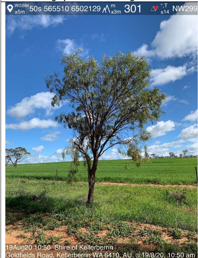
Photograph 55: Tree clearing ID GR-055