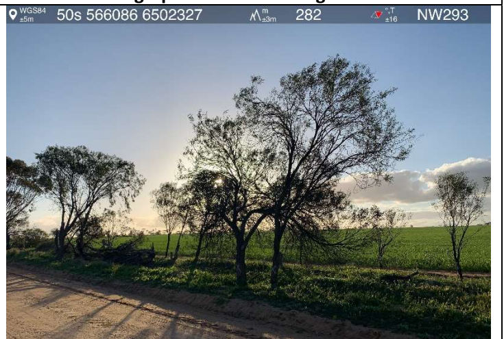
Photograph 44: Tree clearing ID GR-044