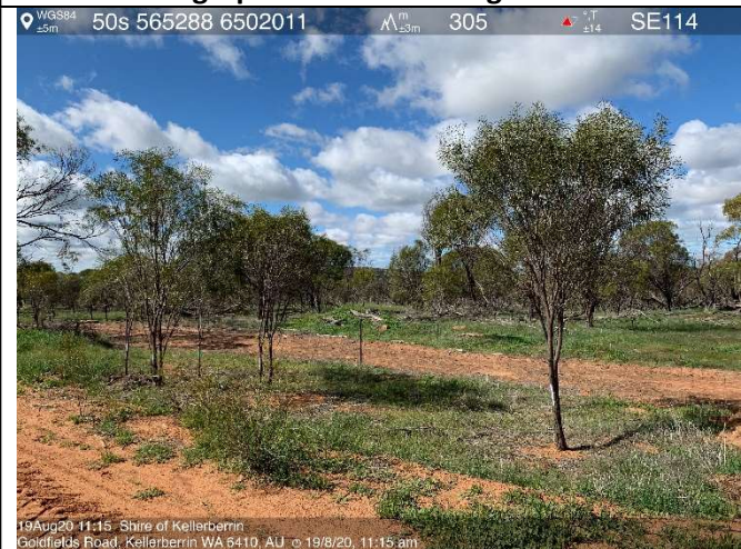
Photograph 63: Tree clearing ID GR-063