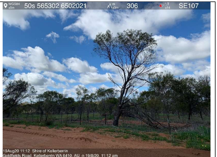
Photograph 62: Tree clearing ID GR-062