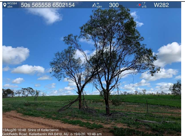
Photograph 54: Tree clearing ID GR-054