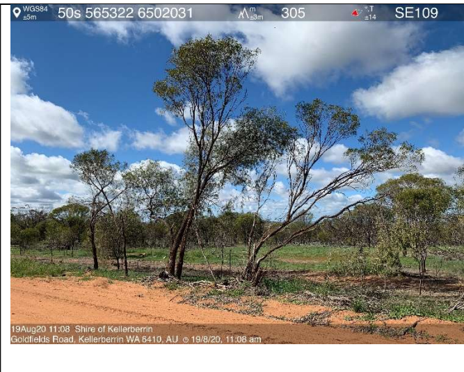
Photograph 61: Tree clearing ID GR-061