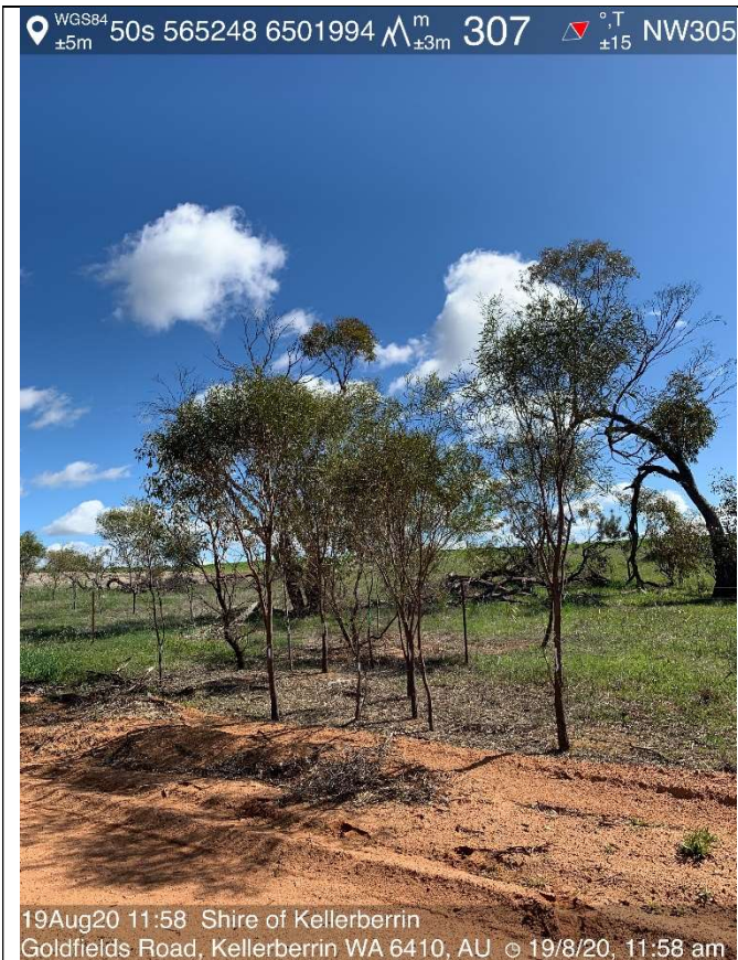
Photograph 77: Tree clearing ID GR-077