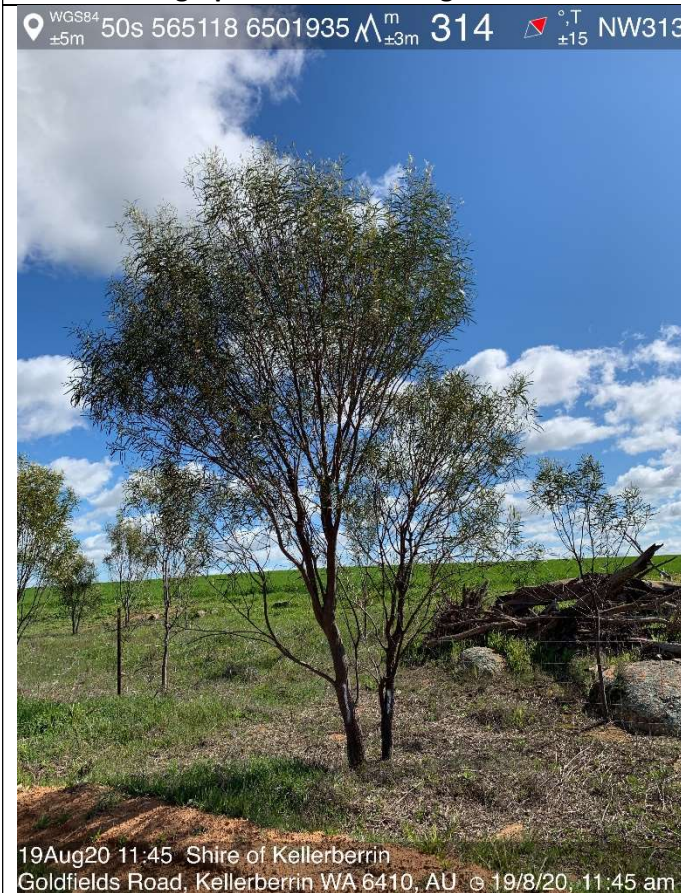
Photograph 71: Tree clearing ID GR-071