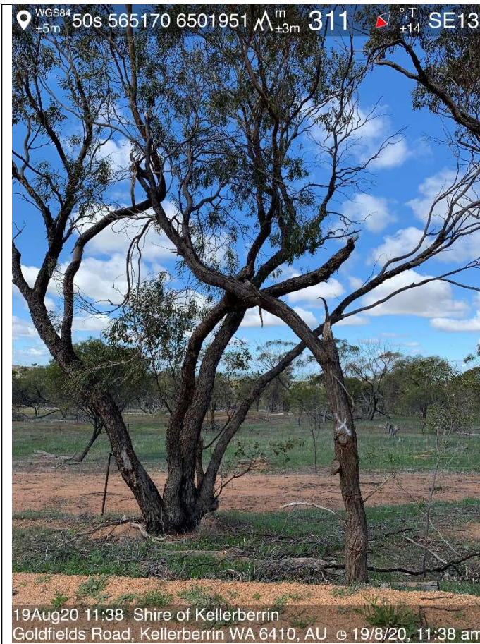
Photograph 69: Tree clearing ID GR-069