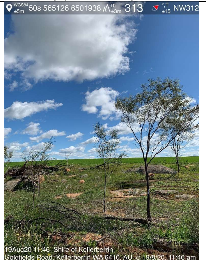
Photograph 72: Tree clearing ID GR-072