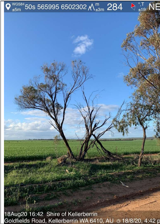
Photograph 41: Tree clearing ID GR-041