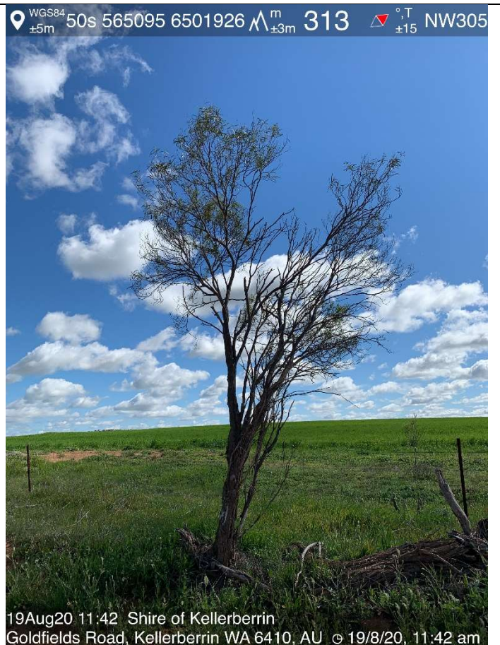
Photograph 70: Tree clearing ID GR-070