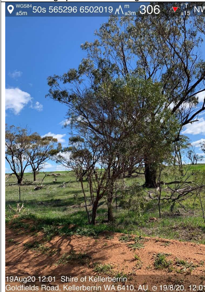
Photograph 79: Tree clearing ID GR-079