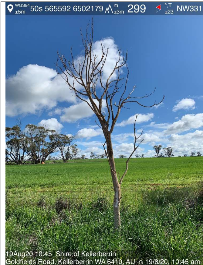
Photograph 53: Tree clearing ID GR-053