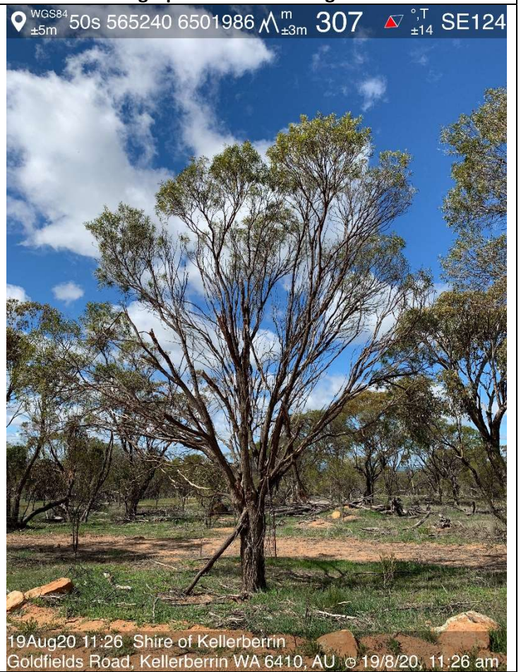
Photograph 64: Tree clearing ID GR-064