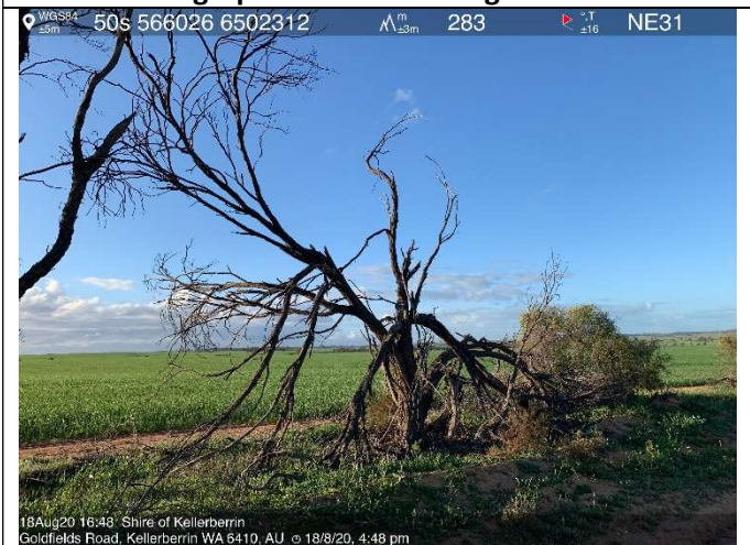
Photograph 43: Tree clearing ID GR-043