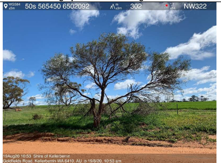
Photograph 56: Tree clearing ID GR-056