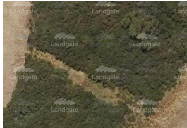
Picture 4: Image from 2017 showing limited vegetation regrowth over a 10 year period.