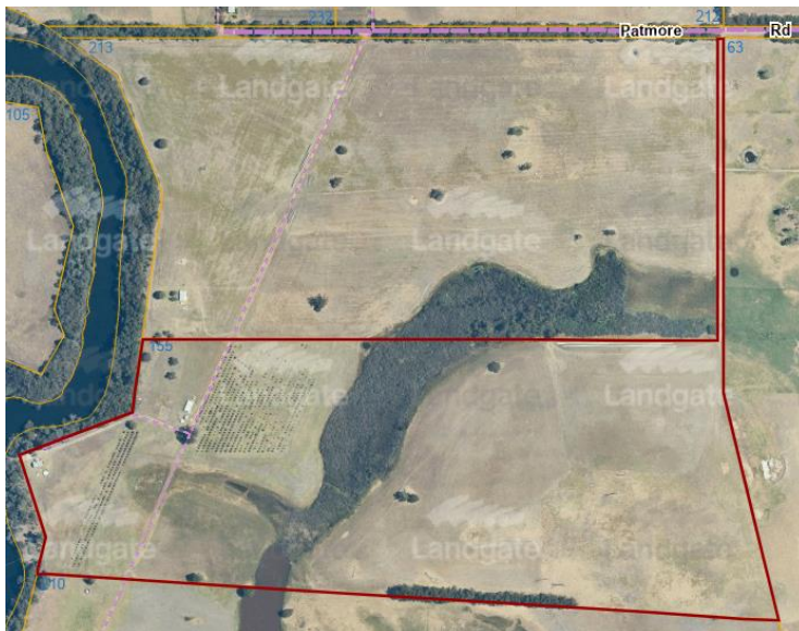
Picture 1 showing access to house, located near western boundary, is via northern neighbours block due to wetlands bisecting the property.

In order for the road to be usable year round and to protect the surrounding vegetation from being damaged by regular vehicle movements we would construct a causeway from rock and gravel, sourced from the property, over this degraded area. It is anticipated there will be minimal impact on the existing tea trees bordering the northern and southern side of the crossing due to the sufficient width of the degraded area, but if any did need to be removed they would be replanted elsewhere, while conversely the construction of the crossing will result in the removal of invasive weeds from within the wetland area. As this project is a high priority for us and we recognise the importance of the local environment we would of course be open to any conditions to manage or mitigate effects of the project so it can proceed.