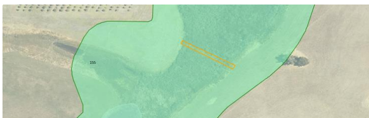
Picture 2 showing proposed crossing located in an environmentally sensitive area.