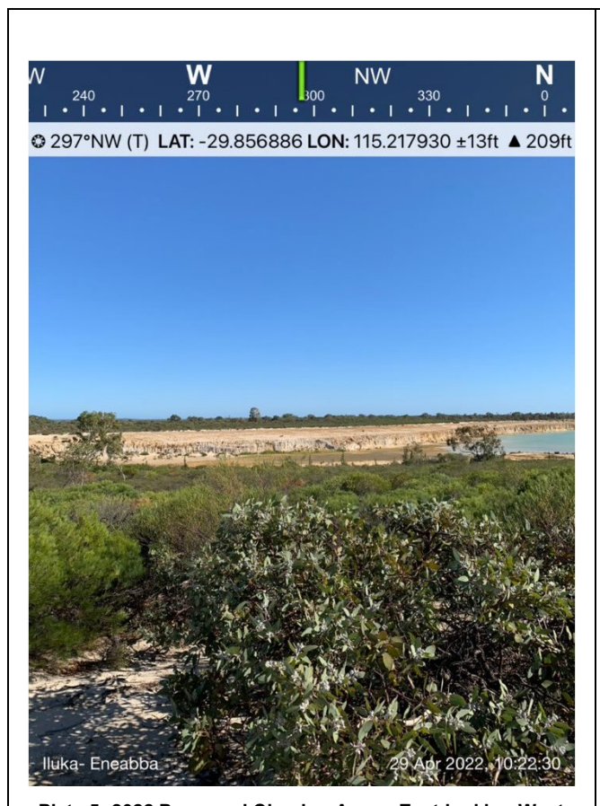
Plate 5: 2022 Proposed Clearing Area – East looking West