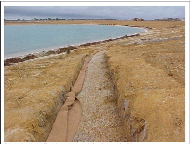
Plate 1: 2003 Earthworks and Drainage in Progress