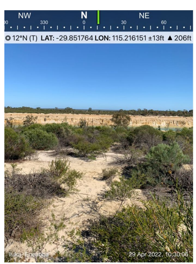
Plate 6: 2022 Proposed Clearing Area - Eastern Section