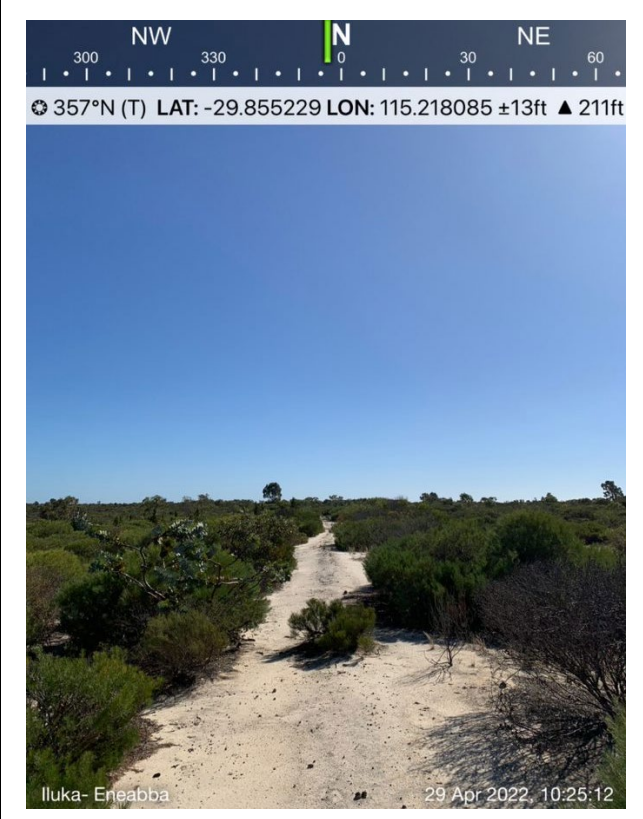
Plate 7: 2022 Access Track (Clearing Required)