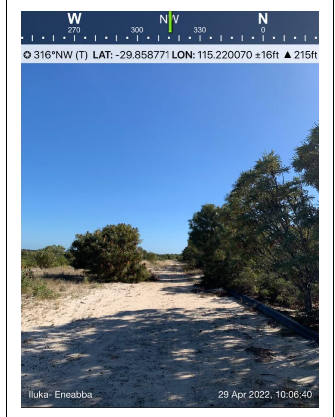
Plate 3: 2022 Access Track (No Clearing Required)