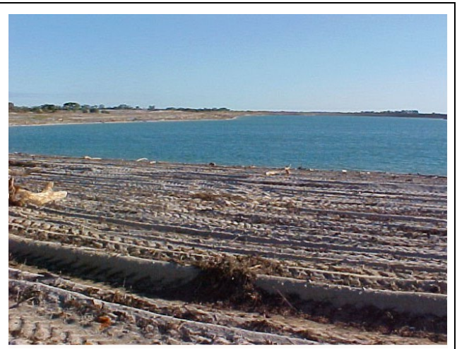
Plate 2: 2003 Rehabilitation in Progress