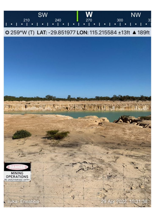
Plate 10: 2022 Mine Void Rework Area with Existing Safety Fence