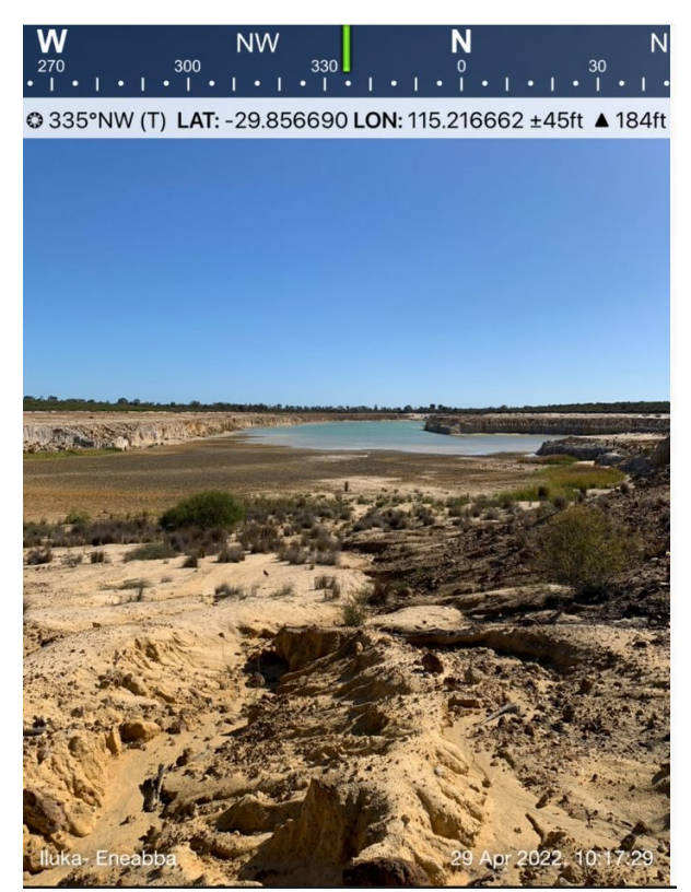
Plate 4: 2022 Mine Void Area- Southern End Looking North