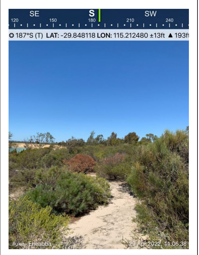
Plate 8: 2022 Proposed Clearing Area – Western Section