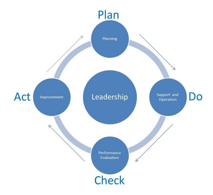
Figure 1: PDCA Cycle

The following figure outlines the main features of the EMS. Environmental improvement is driven using the Plan-Do-Check-Act (PDCA) model Figure 1 .