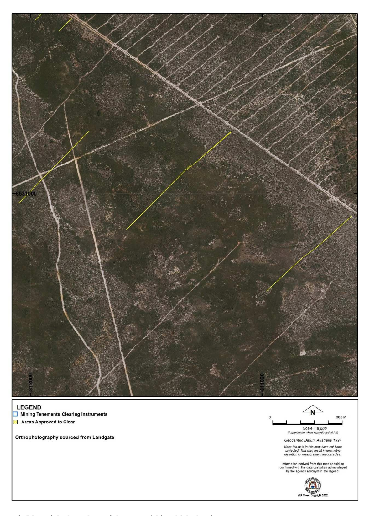
Figure 3: Map of the boundary of the area within which clearing may occur