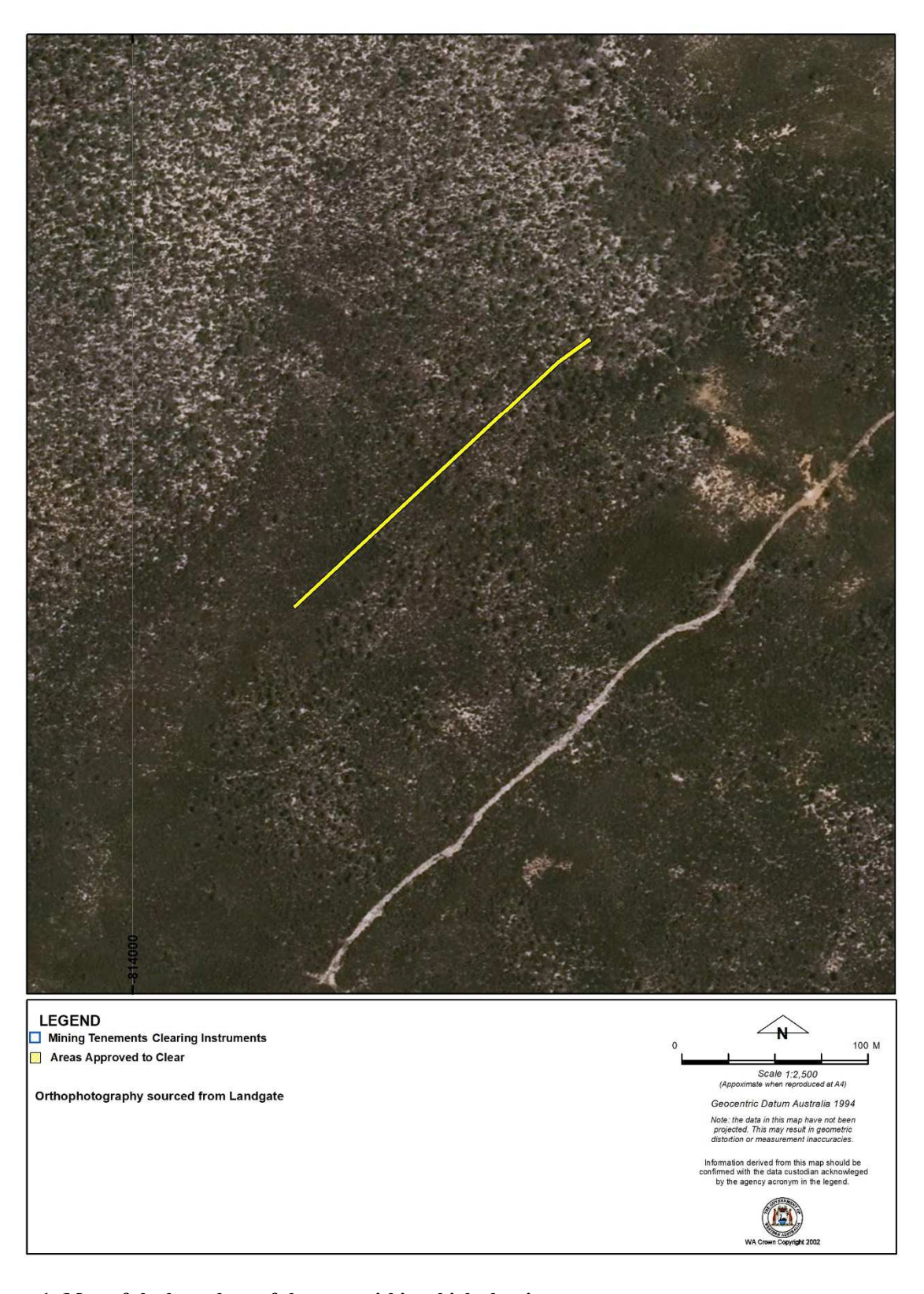
Figure 1: Map of the boundary of the area within which clearing may occur

The boundary of the area authorised to be cleared is shown in the map below (Figure 1-3).