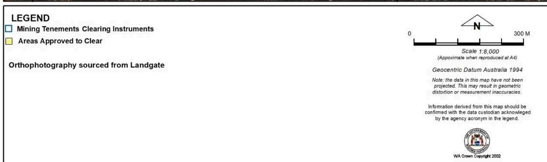
Figure 3: Map of the boundary of the area within which clearing may occur