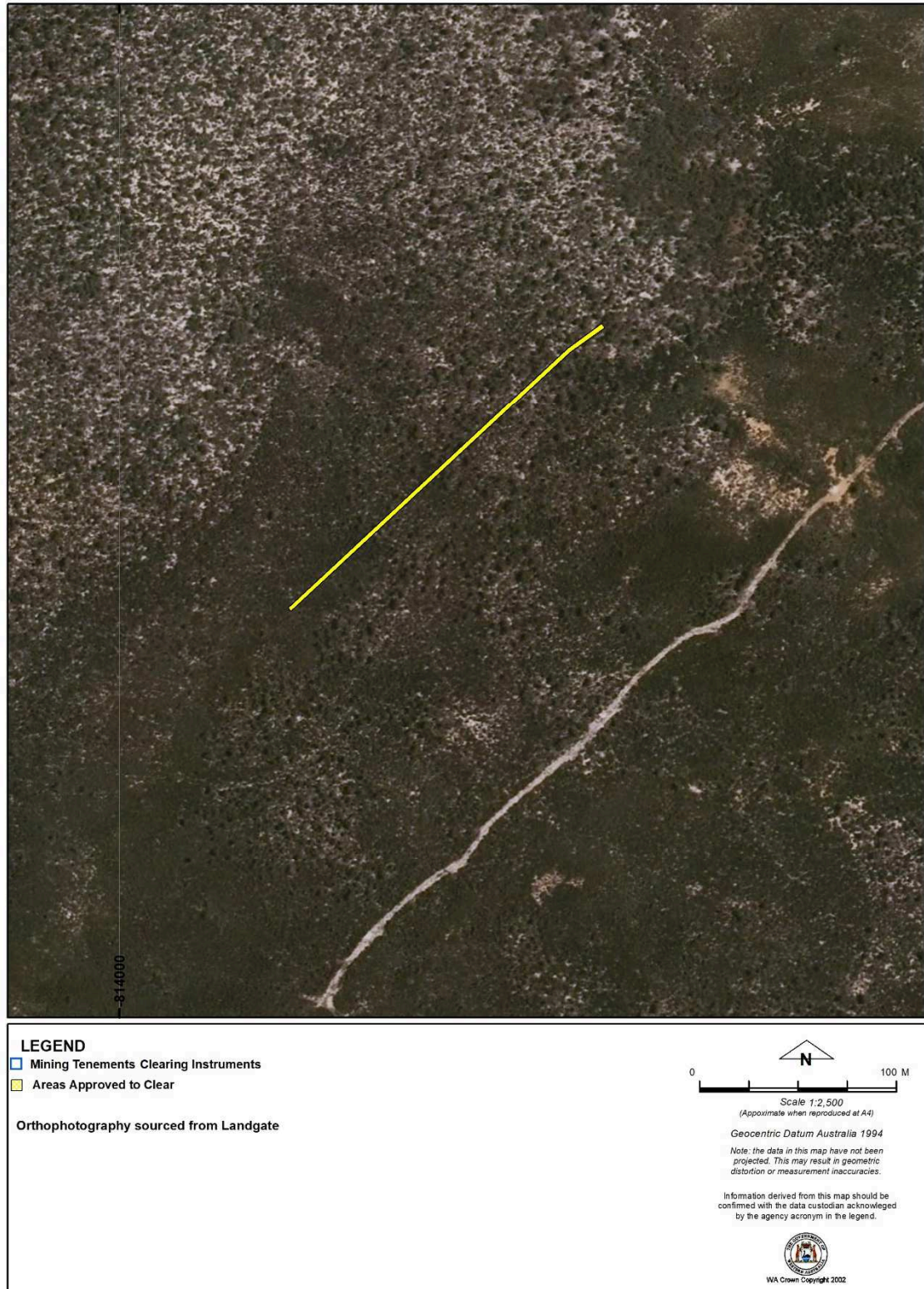
Figure 1: Map of the boundary of the area within which clearing may occur

The boundary of the area authorised to be cleared is shown in the map below (Figure 1-3).