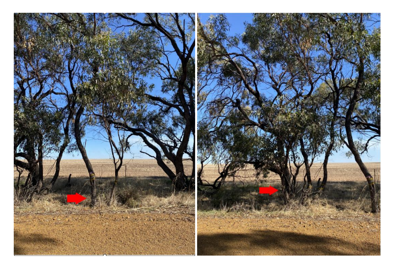
Photo 34: 1 York gum (5m high), multi stems due to epicormic growth and poor pruning previously

ID 13 – Photo 33 : 1 York gum (7m high) + 1 immature York gum to the right