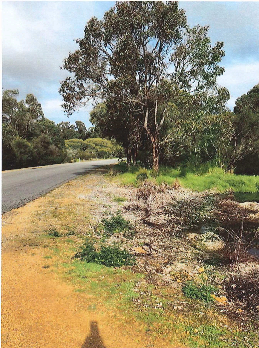
View to south of crossover.

Understorey highly disturbed as on edge of road and near farmland.