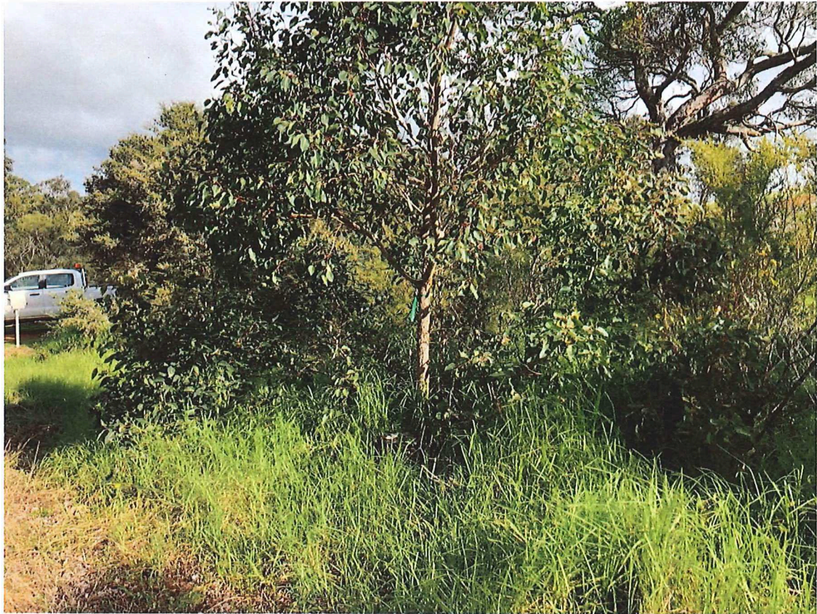
Vegetation to the north of crossover to be cleared for sight lines.