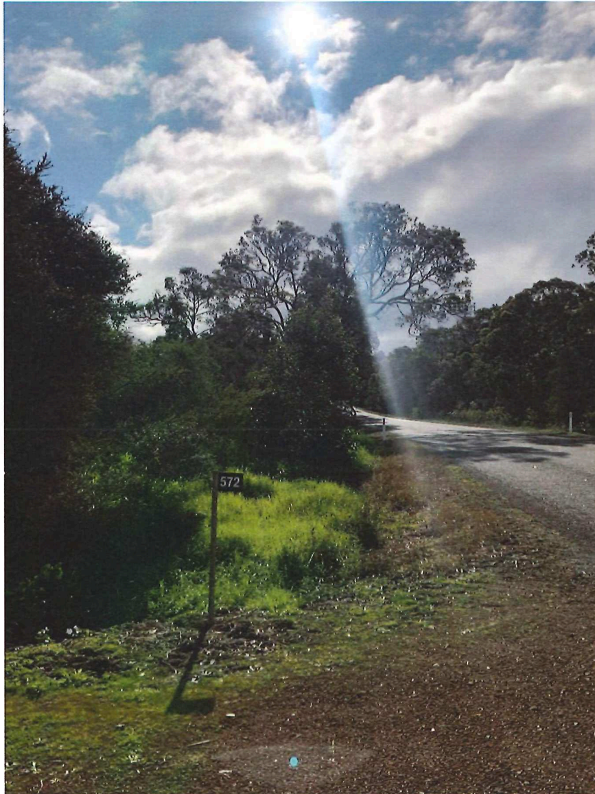
View to the north from the crossover.