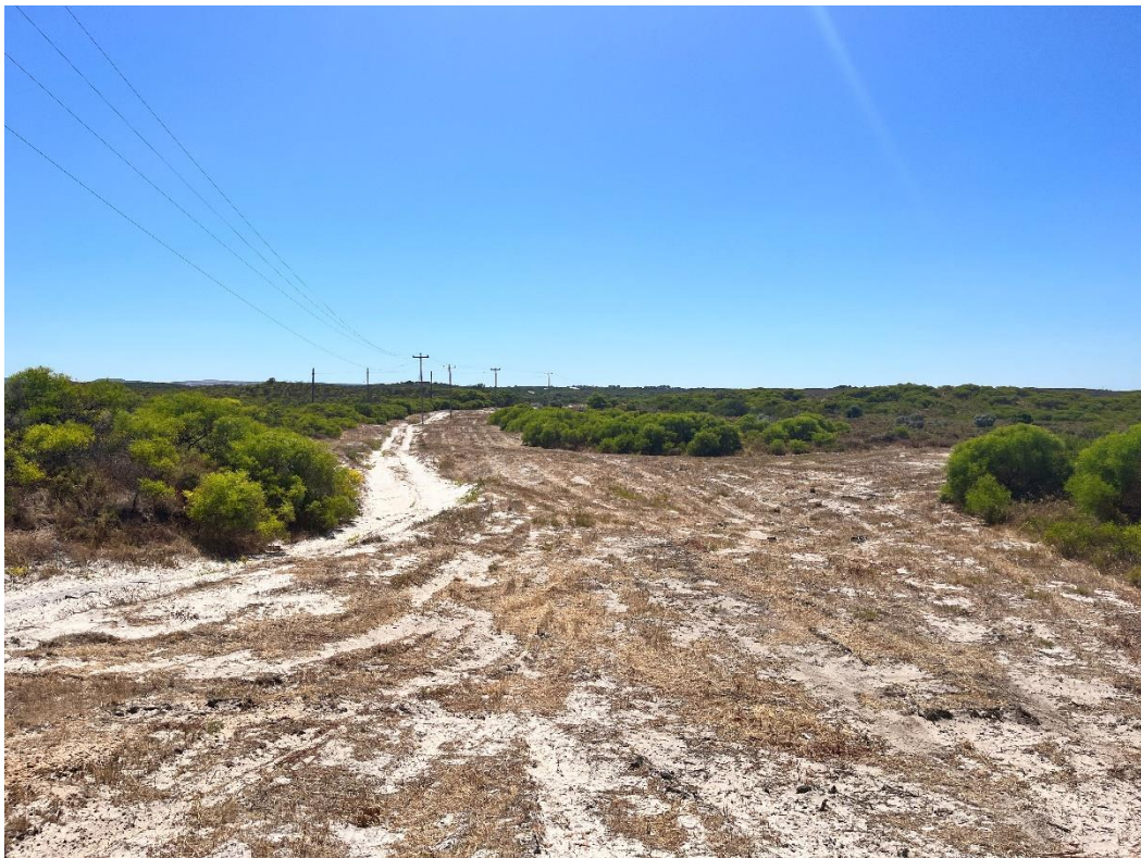
Figure 7 East Facing