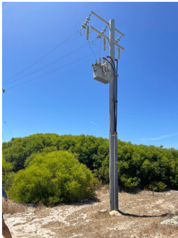
Figure 4 Recloser Southeast Facing