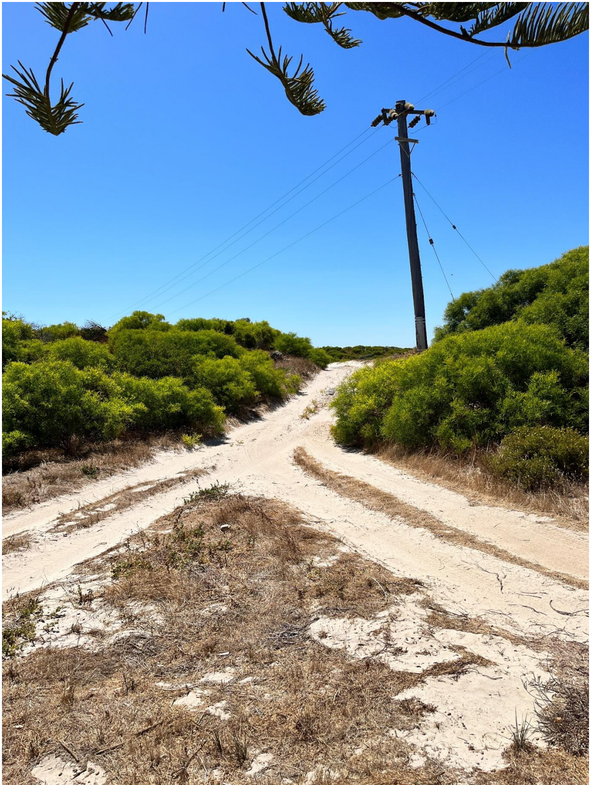
Figure 5 Eastwards