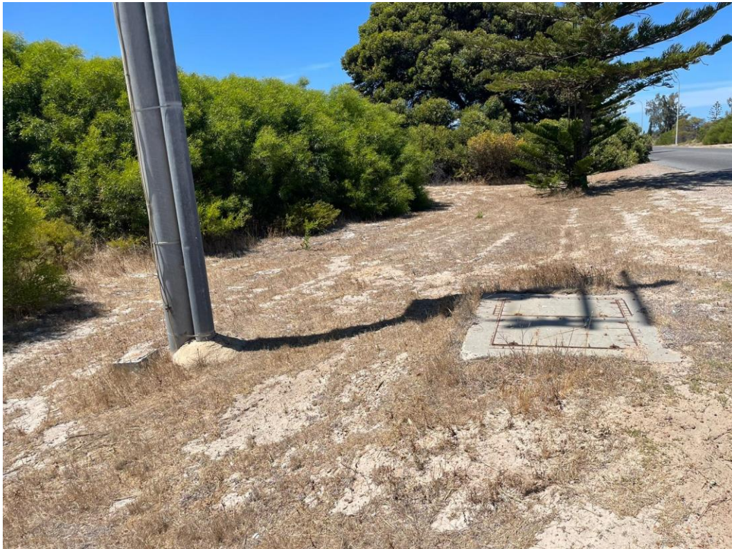
Figure 3 Recloser Southwards