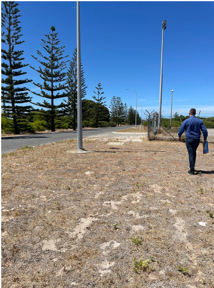
Figure 1 Southwards