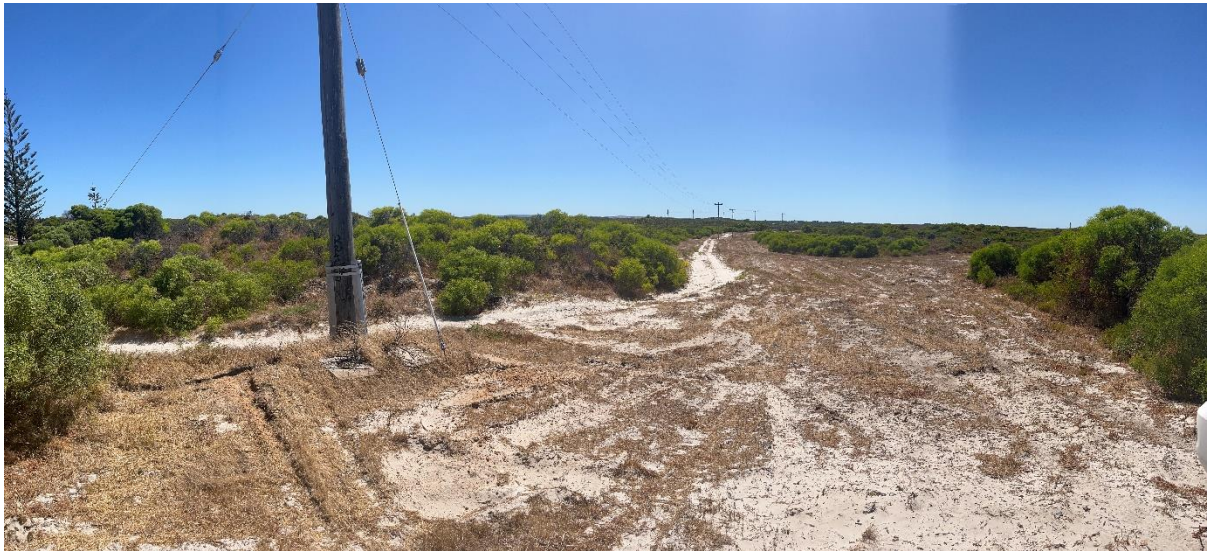
Figure 6 Northeast Facing