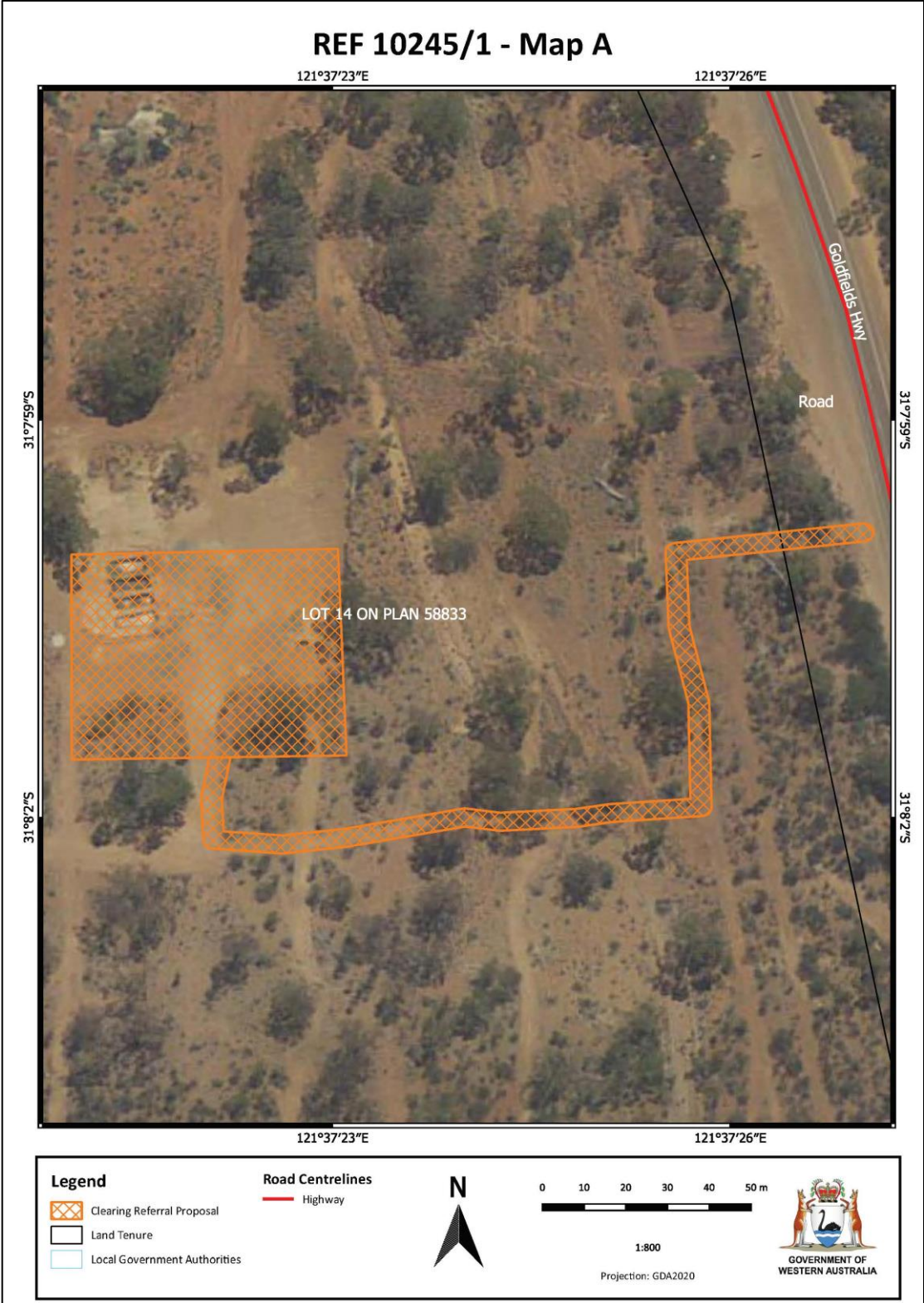
Figure 1: Map of the referral area within which clearing of native vegetation requires a clearing permit.