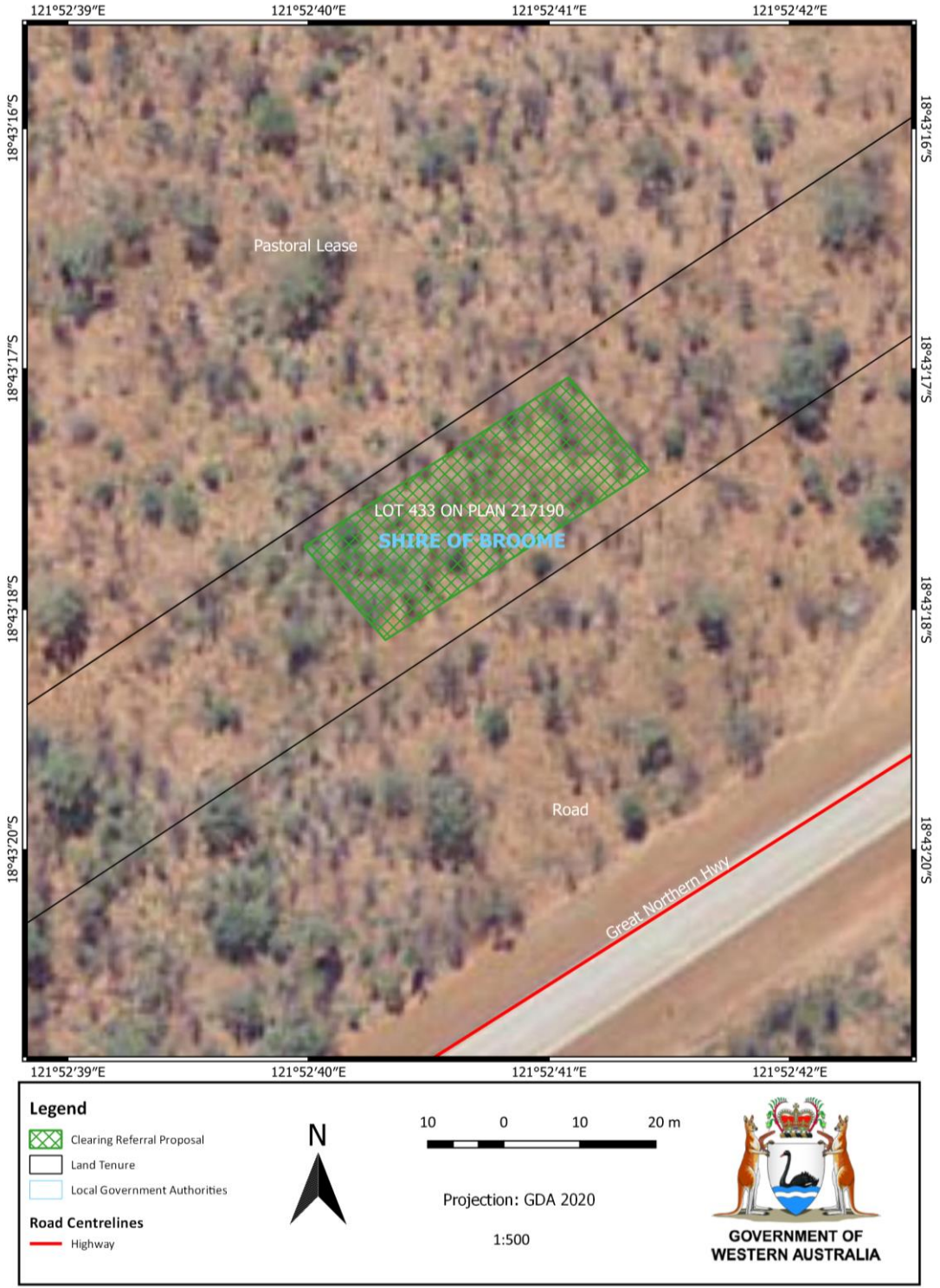
Figure 1: Map of the referral area within which clearing of native vegetation does not require a clearing permit.