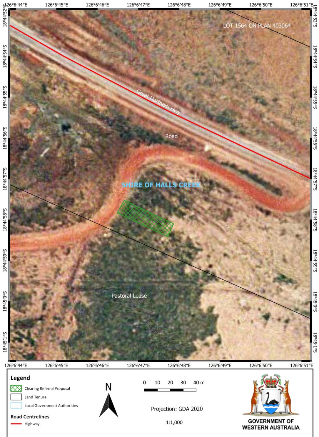
Figure 2: Map of the referral area within which clearing of native vegetation does not require a clearing permit.