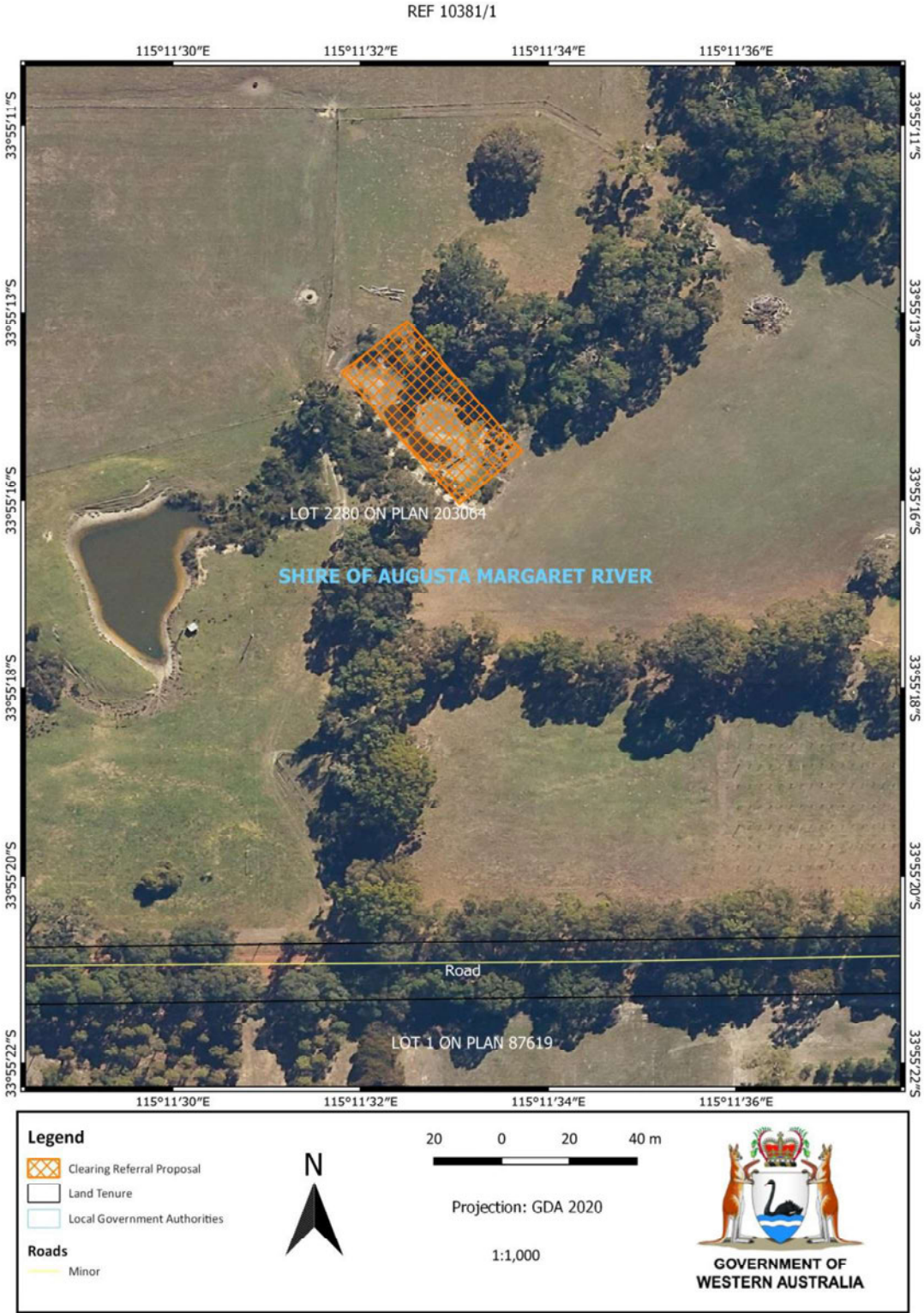
Figure 1: Map of the referral area within which clearing of native vegetation requires a clearing permit.