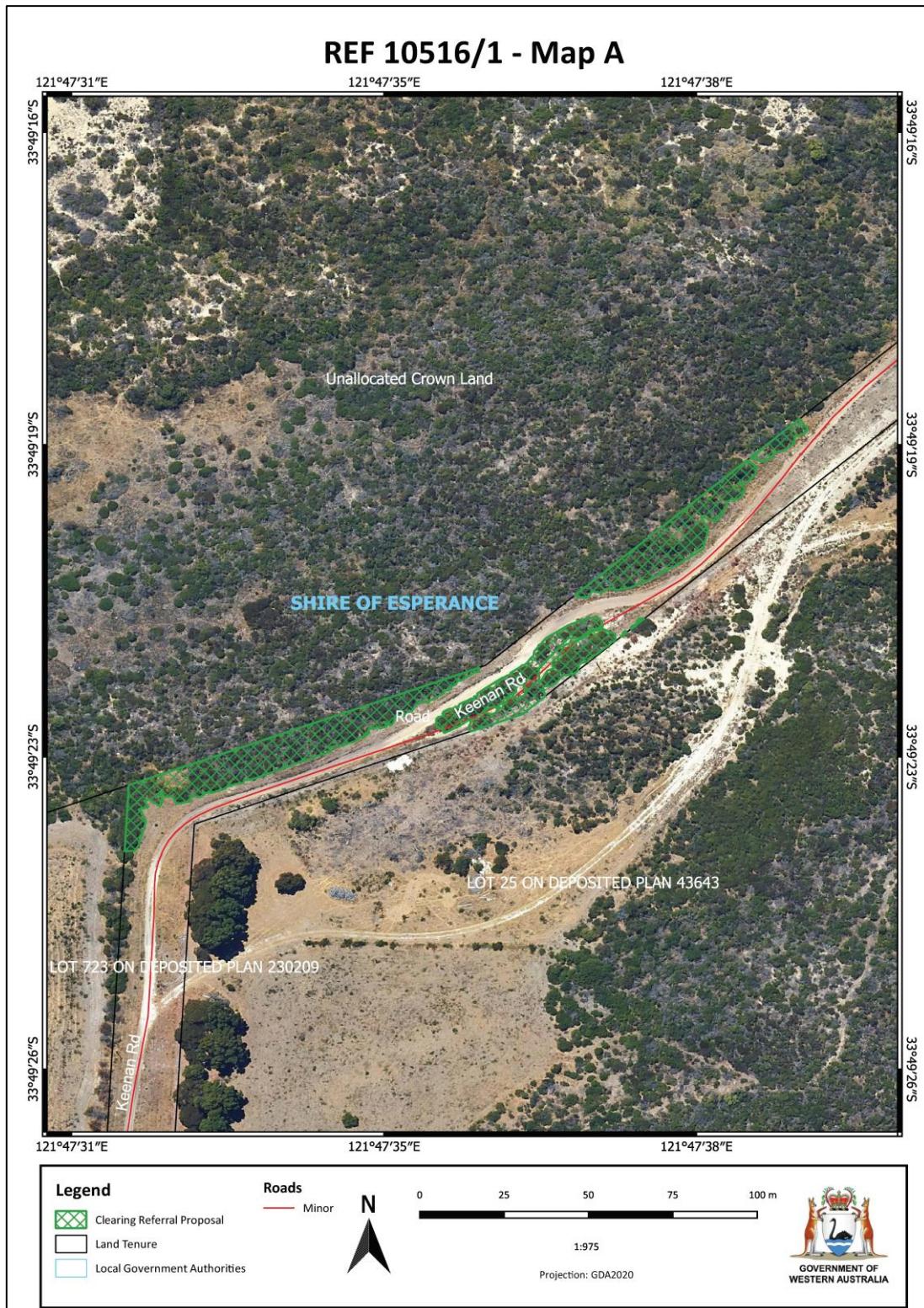
Figure 1: Map of the referral area (“Keenan Road”) within which clearing of native vegetation does not require a clearing permit.