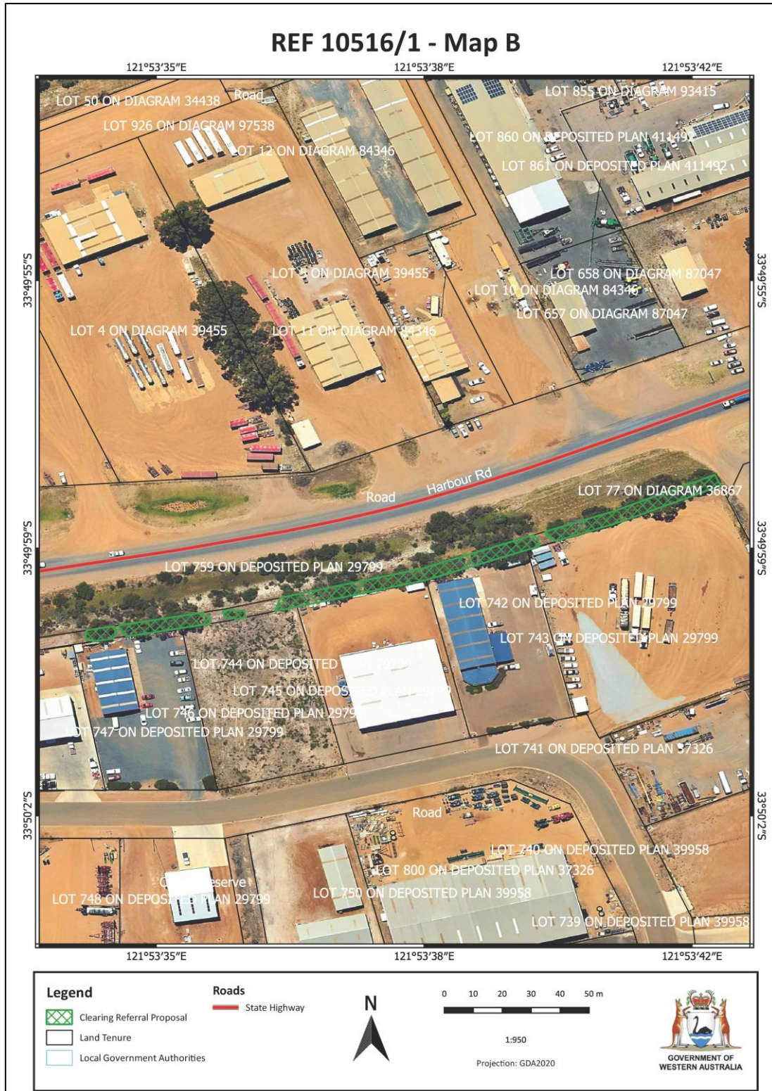
Figure 2: Map of the referral area (“Harbour Road”) within which clearing of native vegetation does not require a clearing permit.