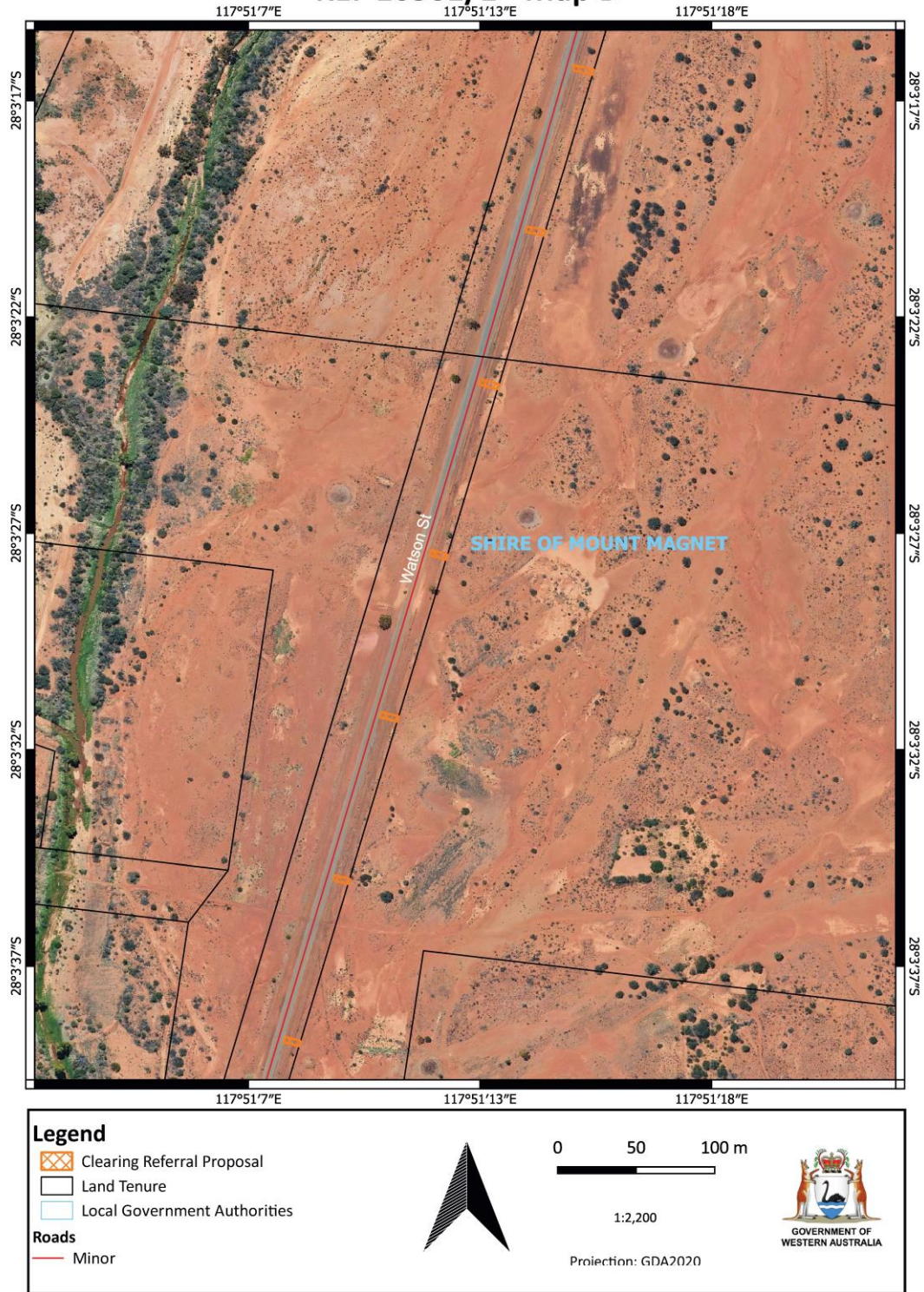
Figure 2: Map of the referral area within which clearing of native vegetation requires a clearing permit.