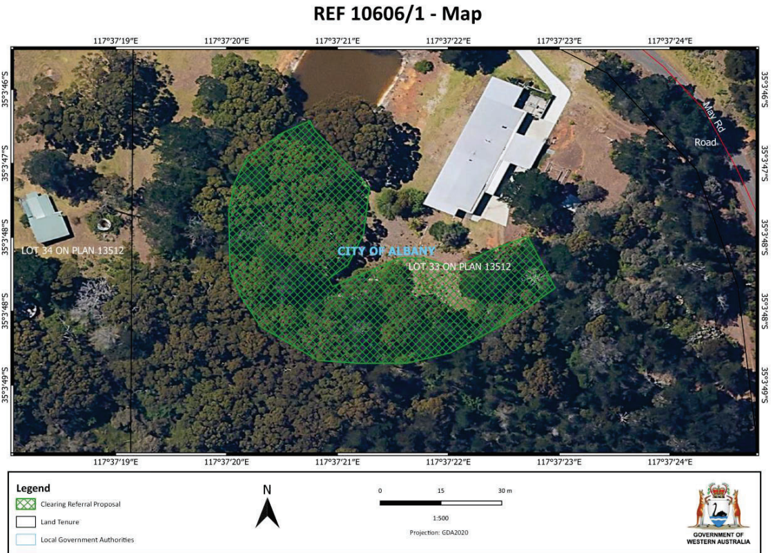
Figure 1: Map of the referral area within which clearing of native vegetation does not require a clearing permit.