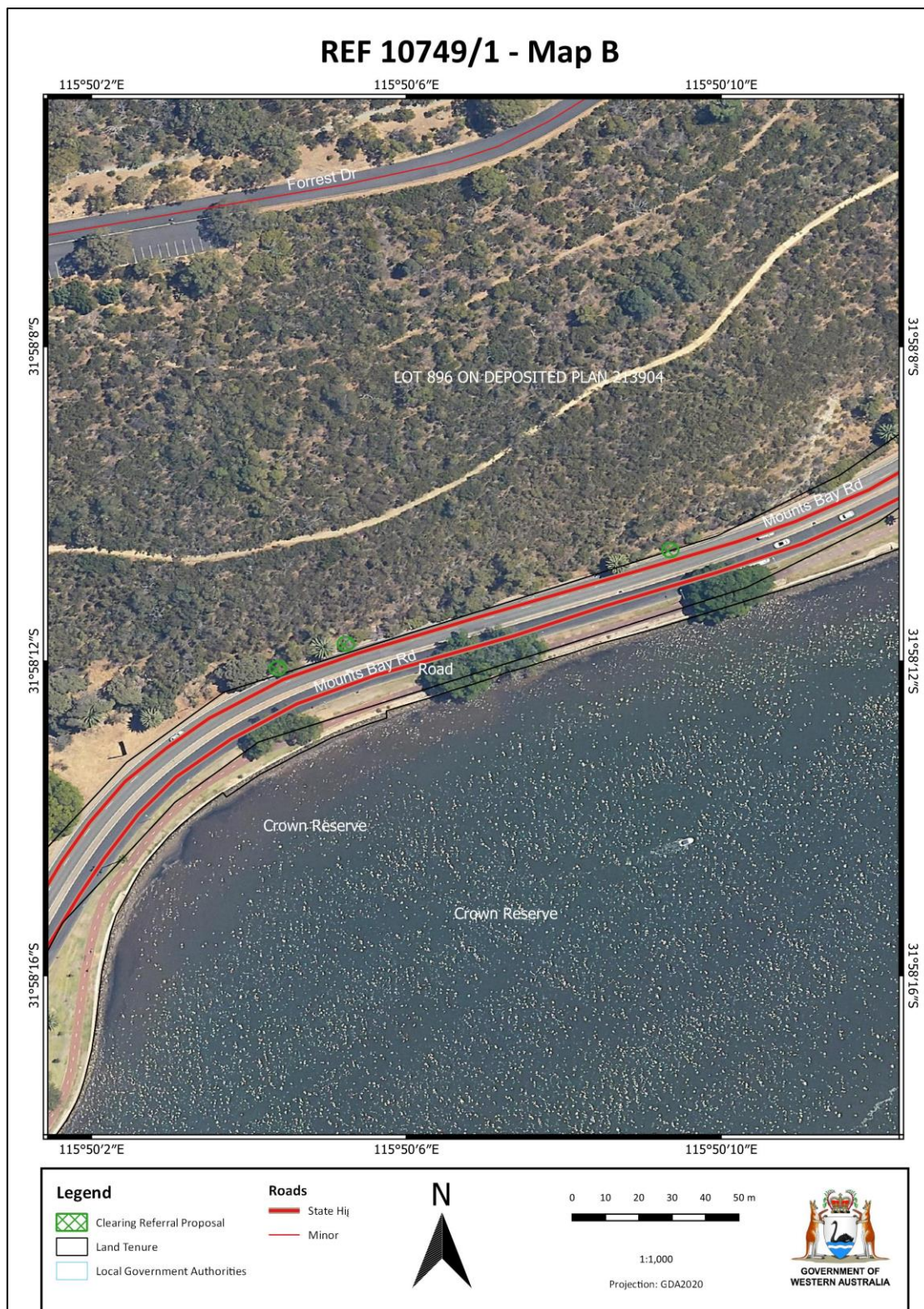
Figure 2: Map of the referral area within which clearing of native vegetation does not require a clearing permit.