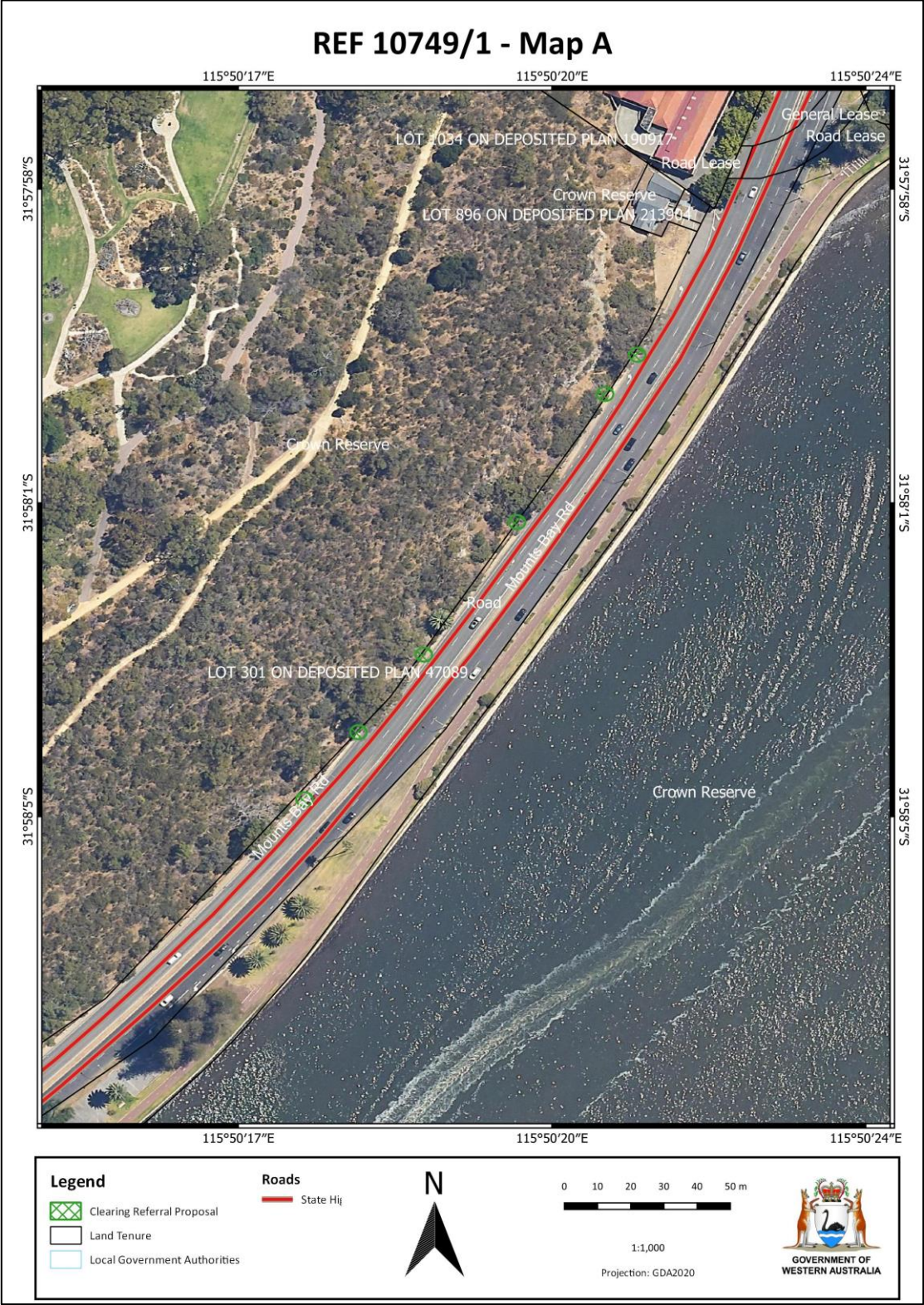
Figure 1: Map of the referral area within which clearing of native vegetation does not require a clearing permit.