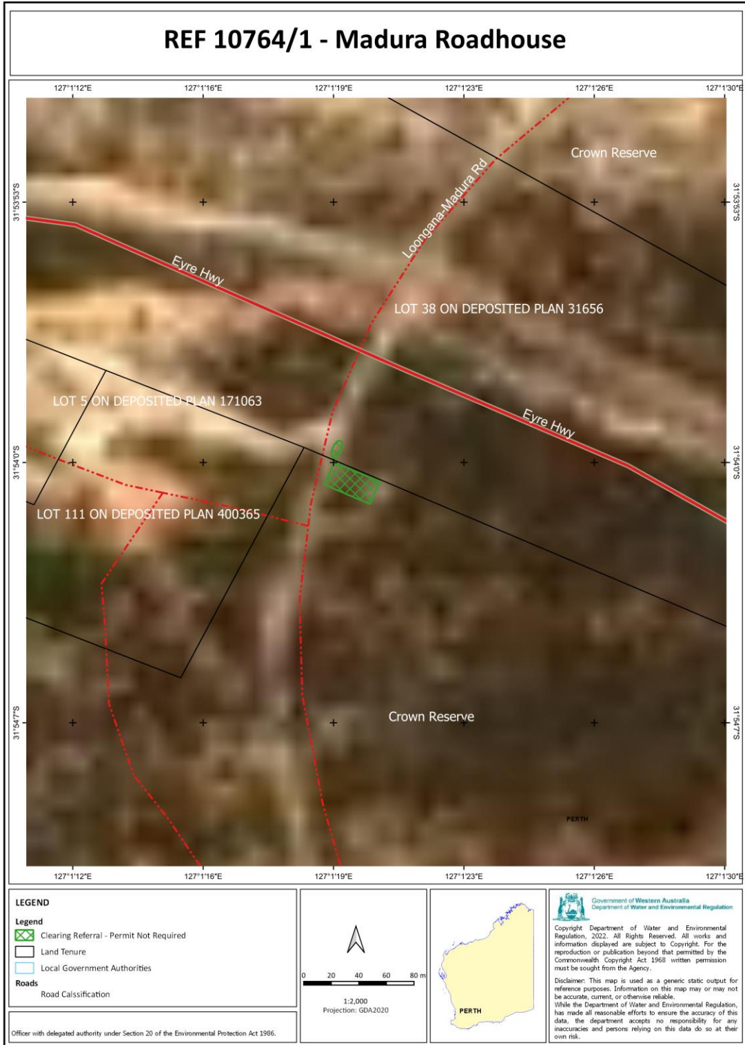
Figure 2: Map of the referral area within which clearing of native vegetation does not require a clearing permit.