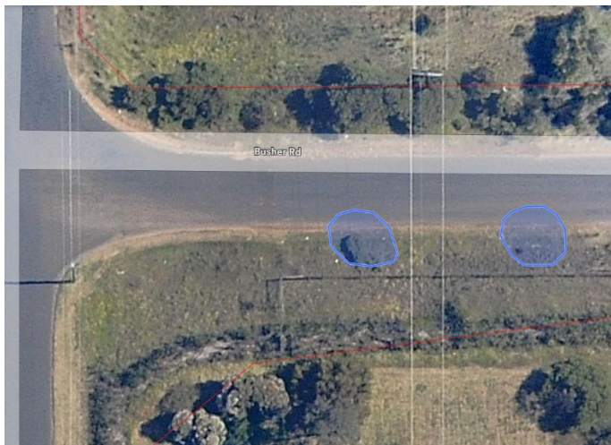
Nearmaps Image 11/12/2009

Nearmap images strongly suggest that the area of road reserve was completely cleared, probably when the road and drain were constructed, and that the two trees have grown over a period of around 15 years.