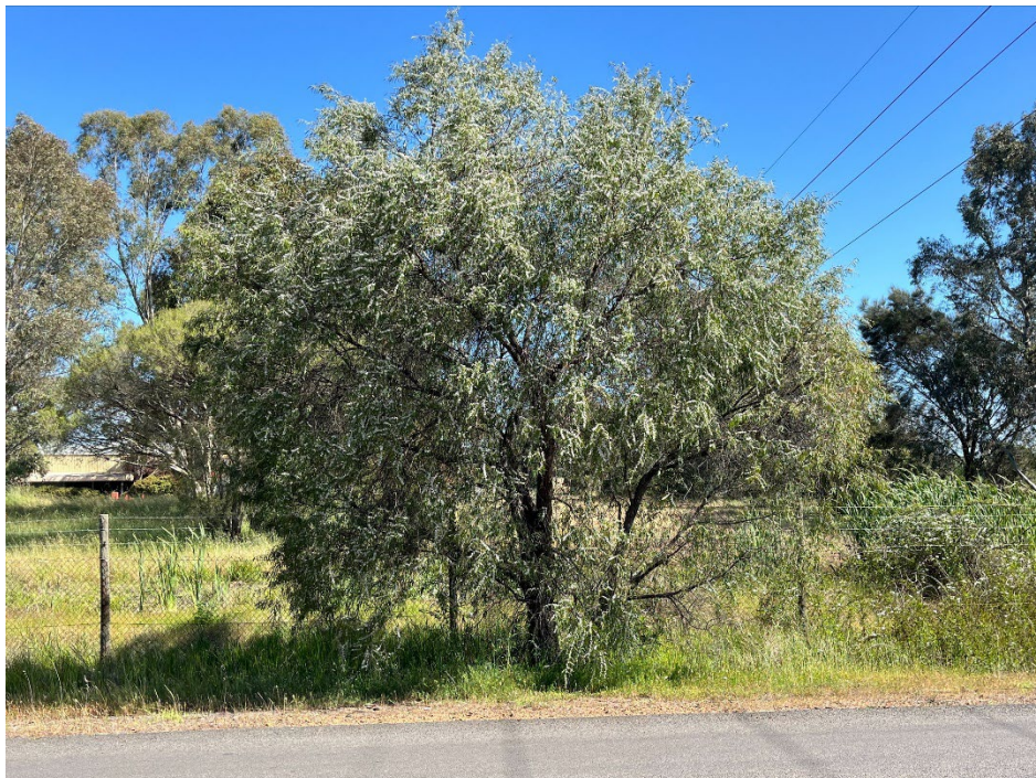
Tree 1 – " Agonis Flexuosa " (Peppy tree)