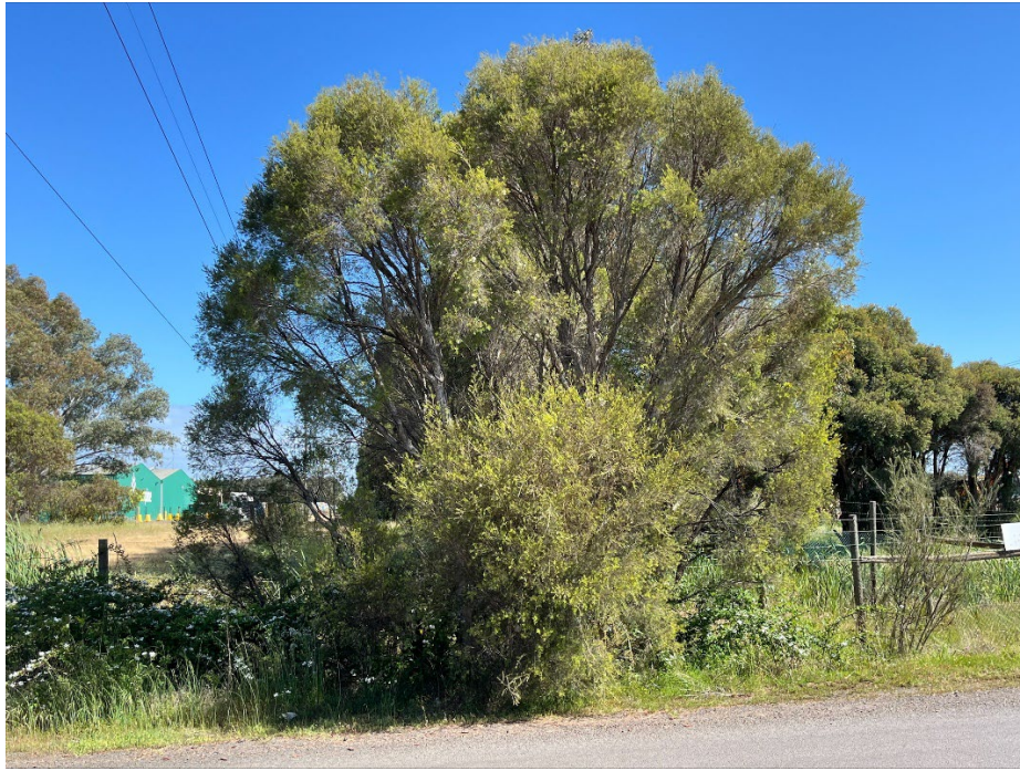
Tree 2 – "Melaleuca raphiophylla" (Paperbark tree)

The adjacent drain is full of introduced weeds and grasses, including wild oat ( Avena barbata ), kikuyu grass and blackberry ( Rubus spp).