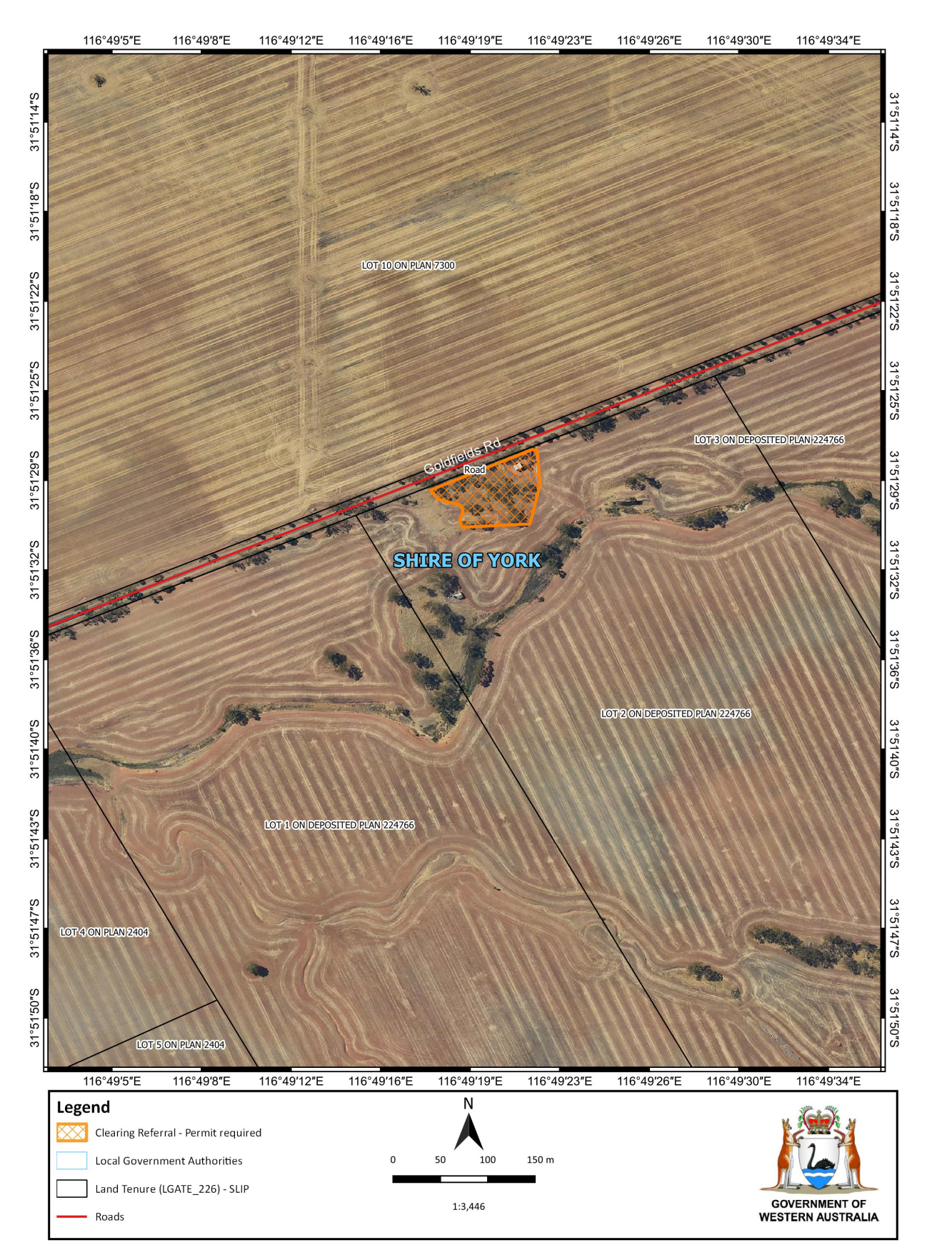
Figure 3: Map C: Map of the referral area within which clearing of native vegetation requires a clearing permit.