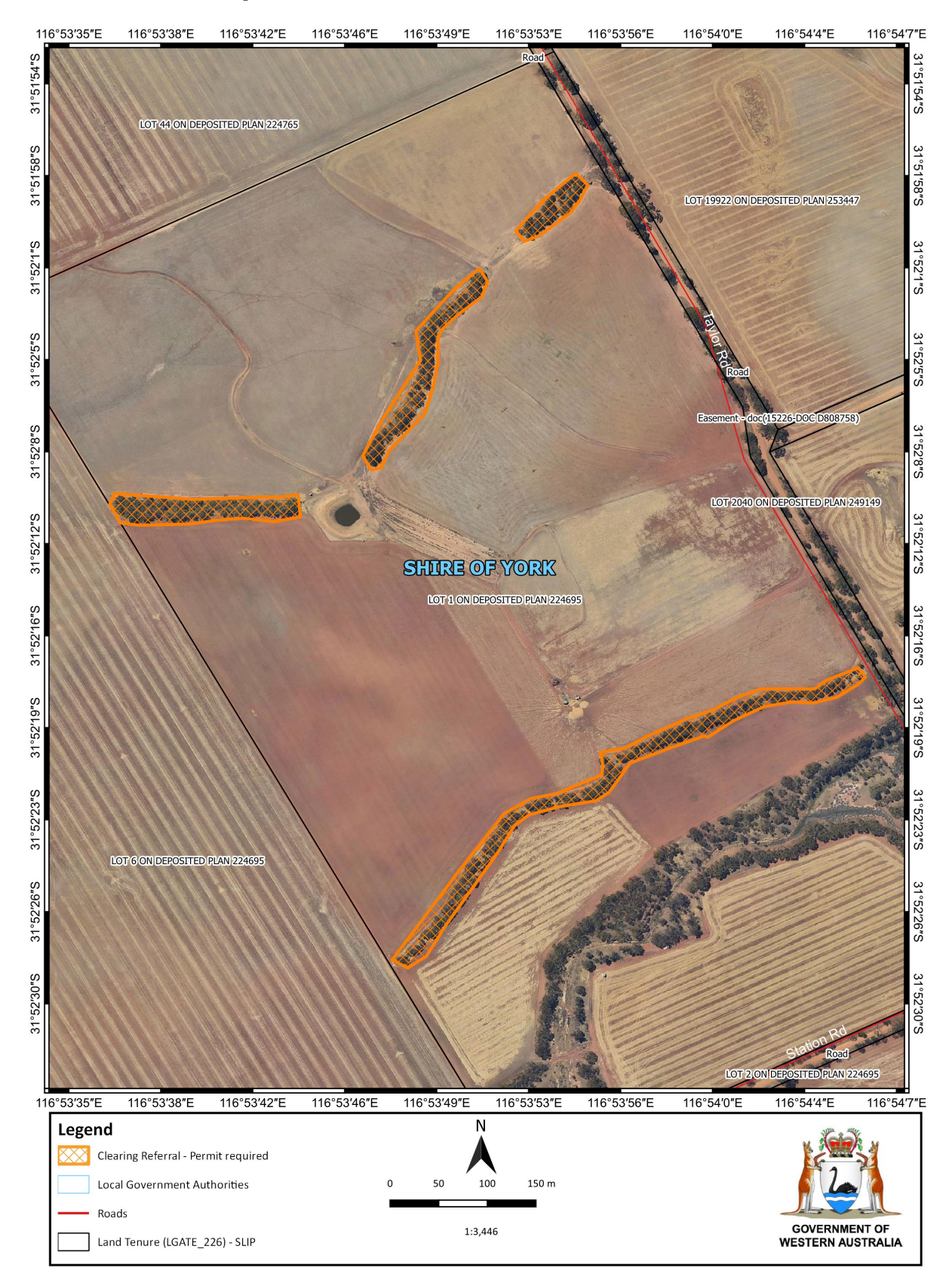
Figure 1: Map A: Map of the referral area within which clearing of native vegetation requires a clearing permit.