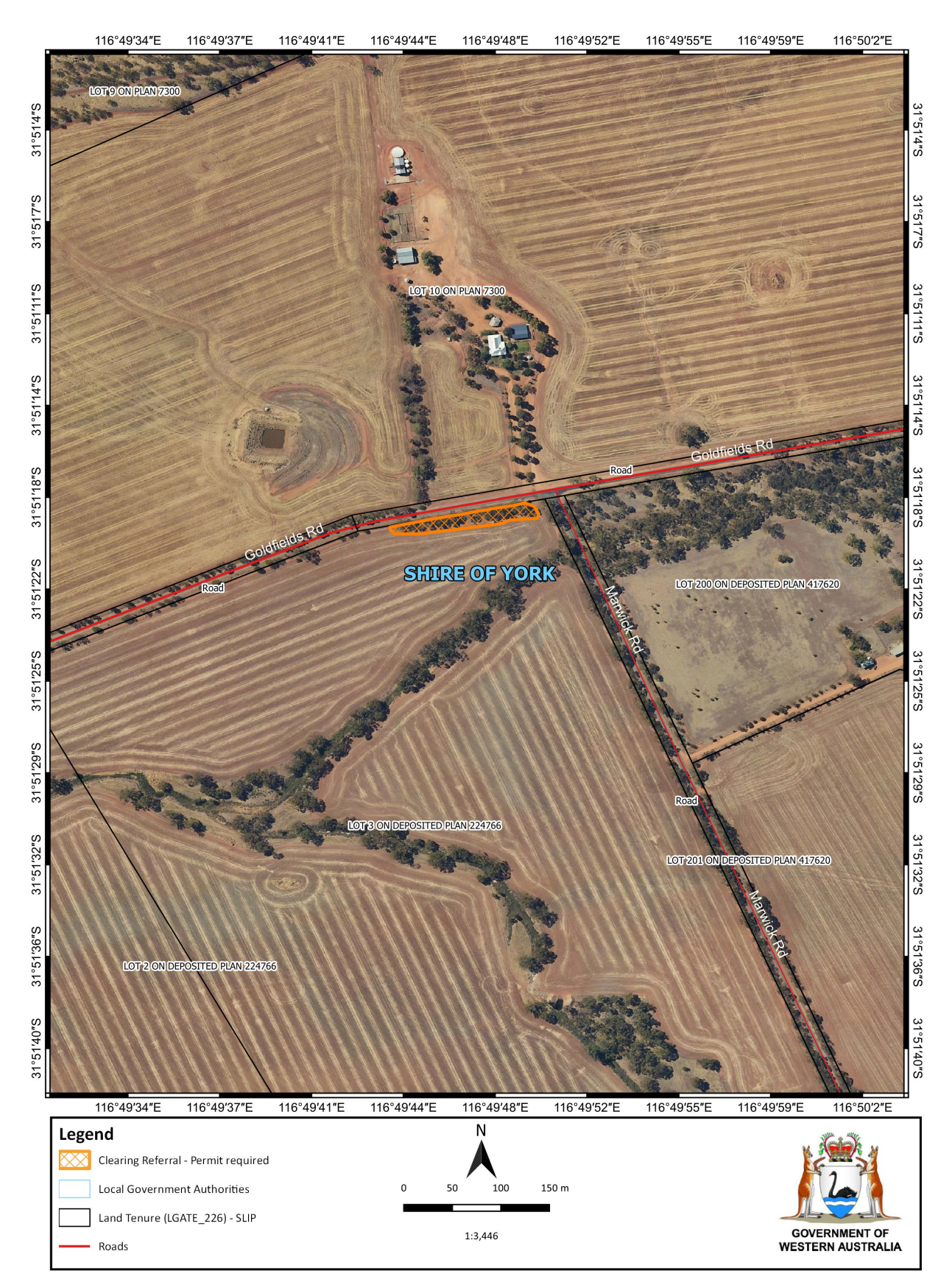
Figure 4: Map D: Map of the referral area within which clearing of native vegetation requires a clearing permit.