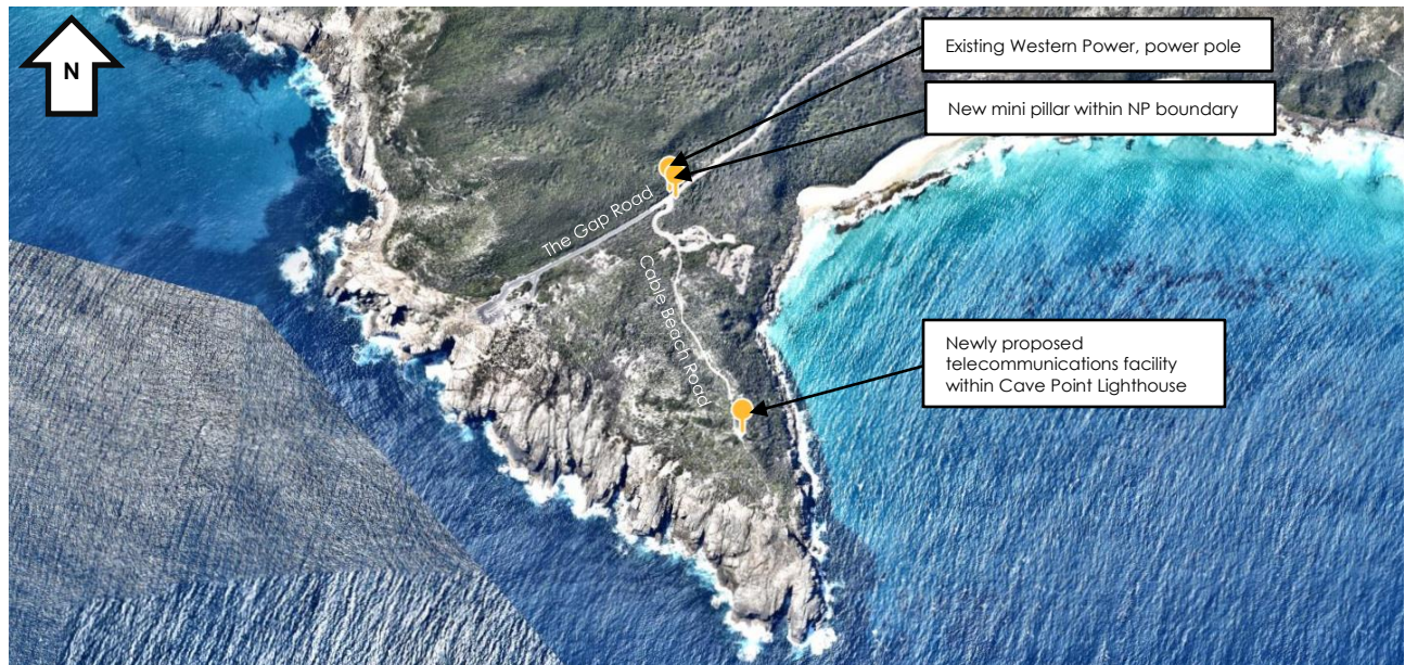
Figure 1: Locality Map