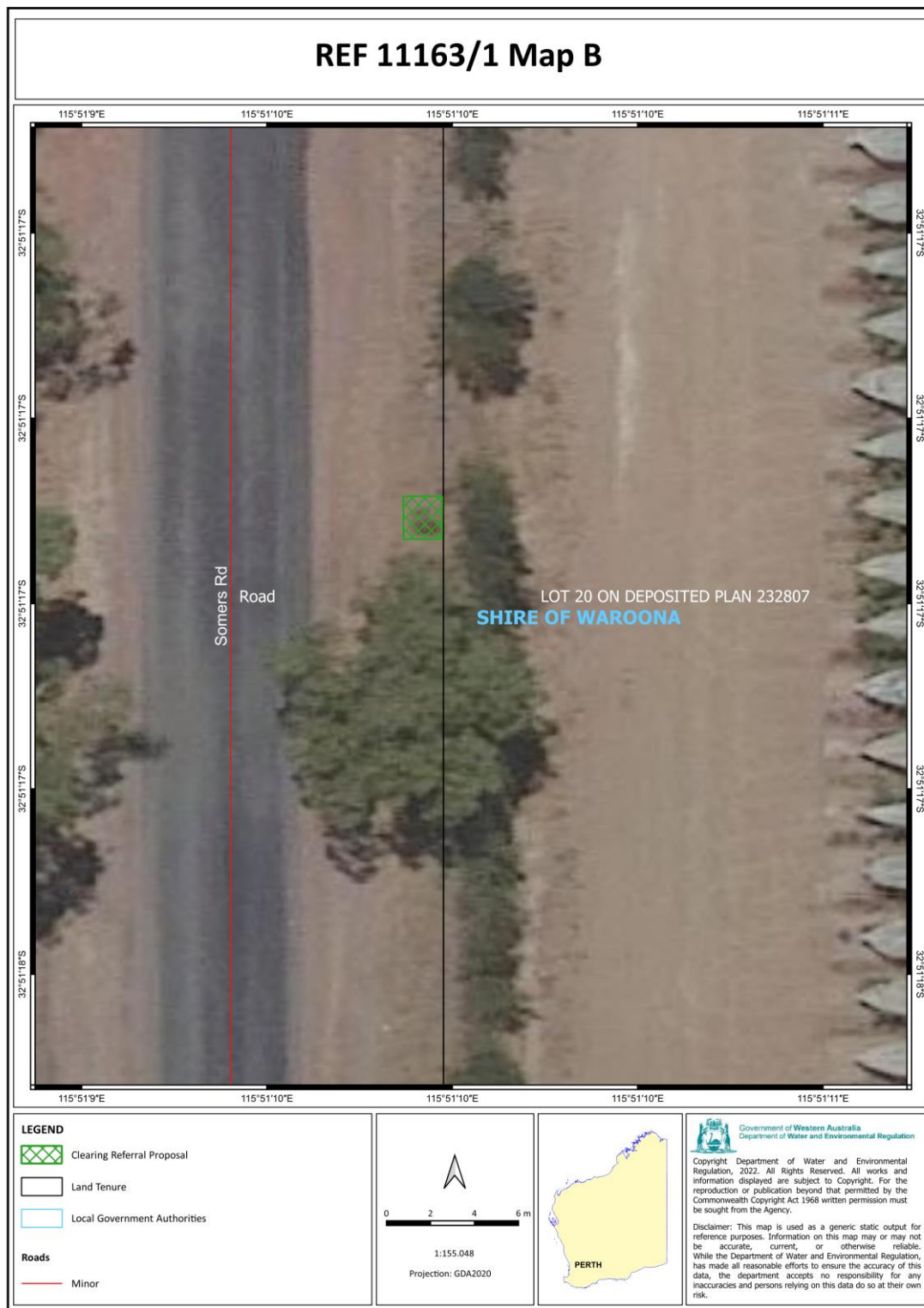
Figure 2: Map of the referral area within which clearing of native vegetation does not require a clearing permit.