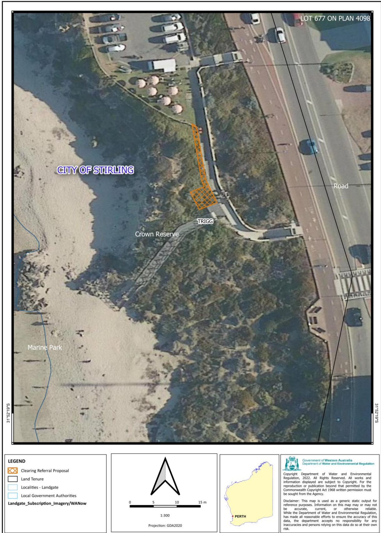
Figure 2: Map of the referral area within which clearing of native vegetation requires a clearing permit.