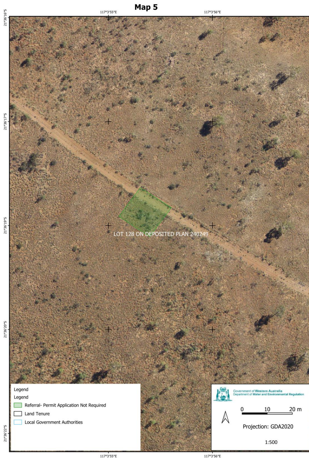
Figure 1: Maps 1-5 of the referral area within which clearing of native vegetation does not require a clearing permit.