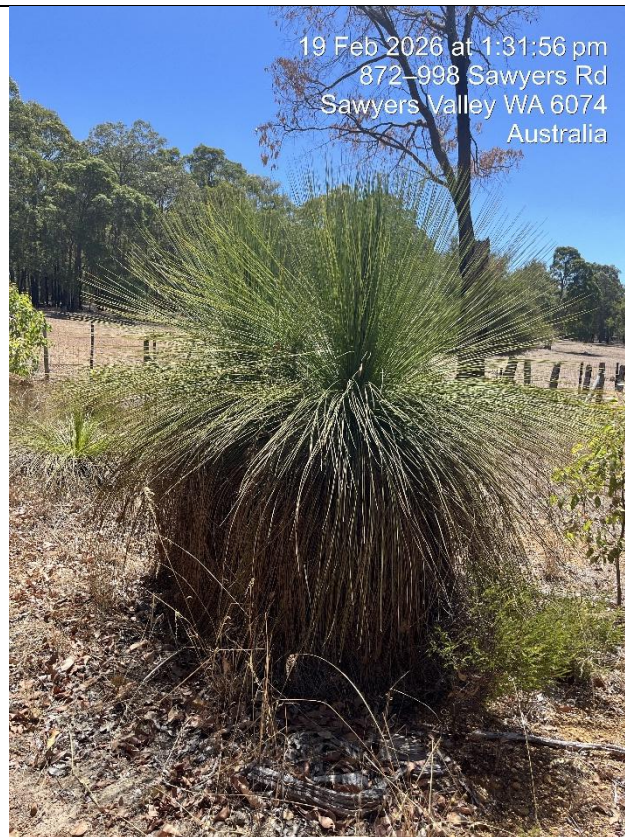
Mature grass trees present on site