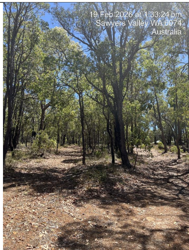
Fork in the firebreak