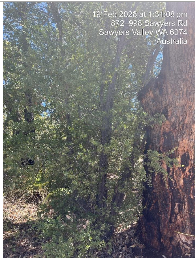
Coast Tree Tea on eastern side of the break