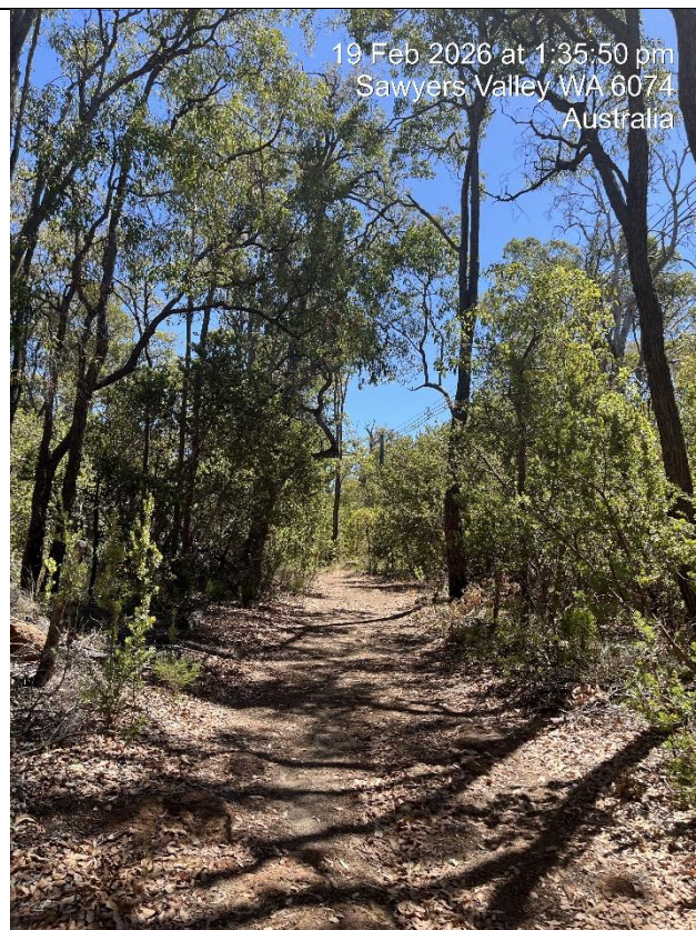
Healthy bush leading into the reserve