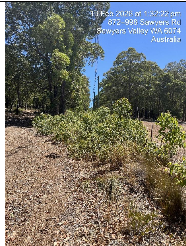
Overly crowded tree regrowth