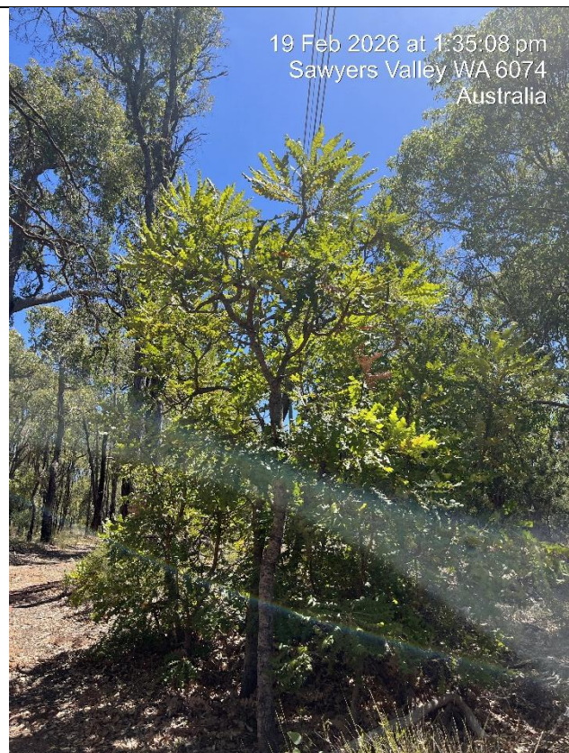
Bull Banksias on site