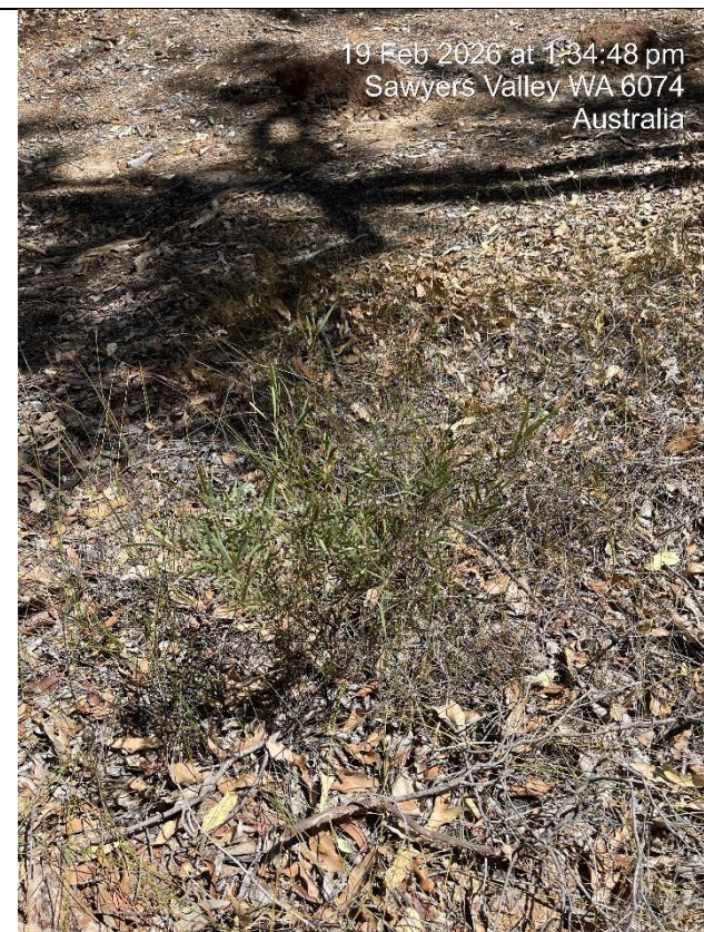
Flinders Range Wattle