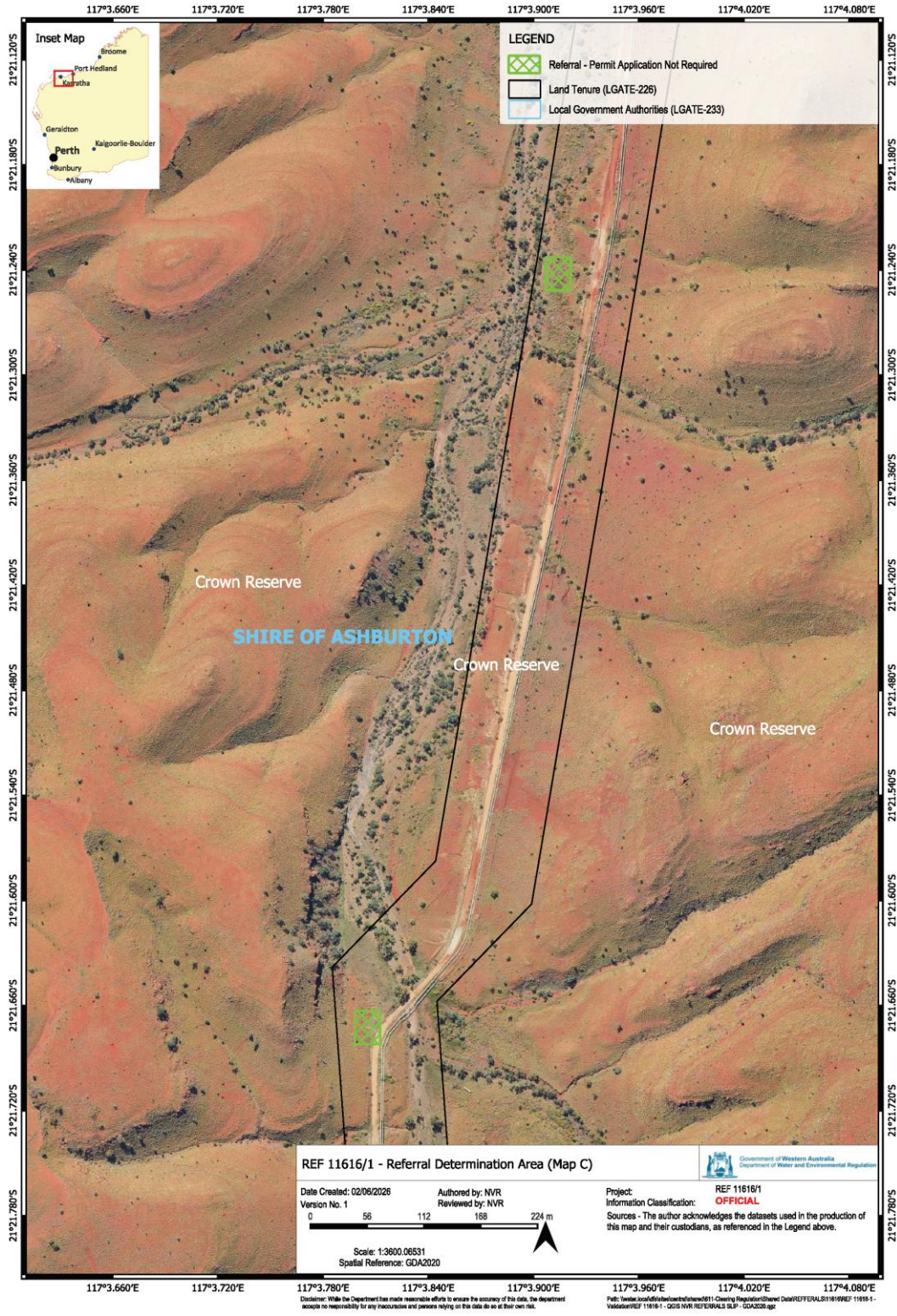
Figure 3: Map of the referral area within which clearing of native vegetation does not require a clearing permit.