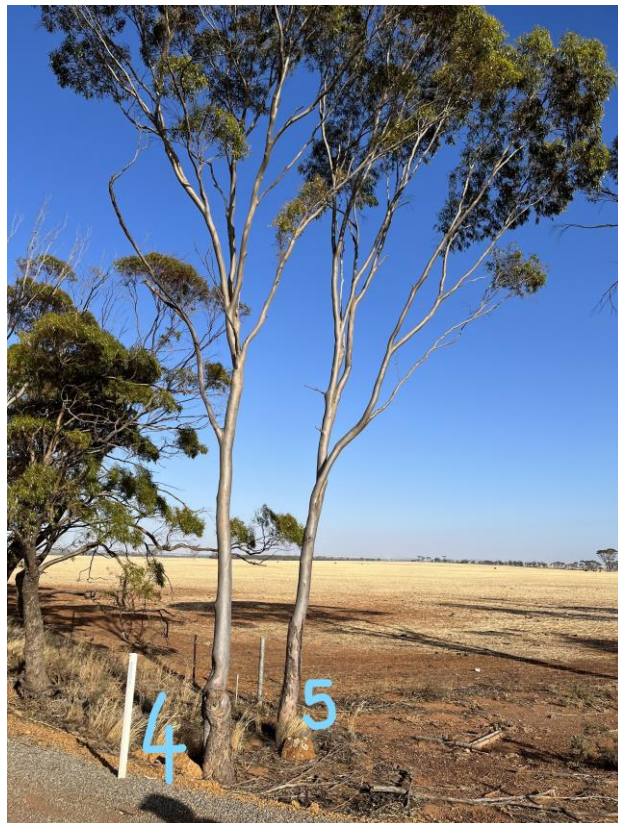
Figure 6. Tree 4 and 5