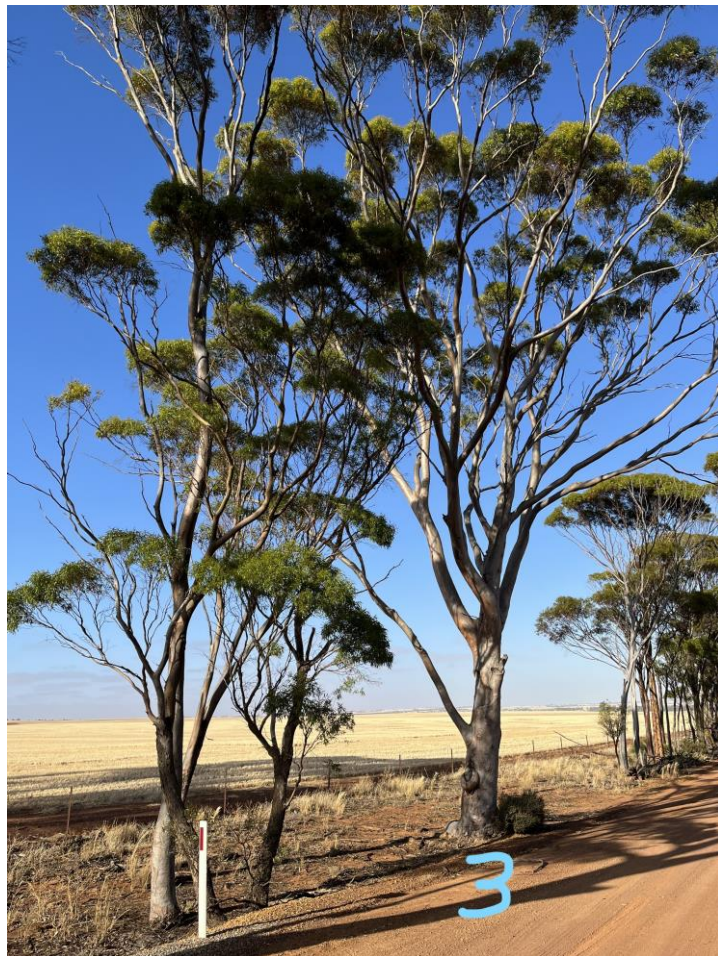
Figure 4. Tree 3