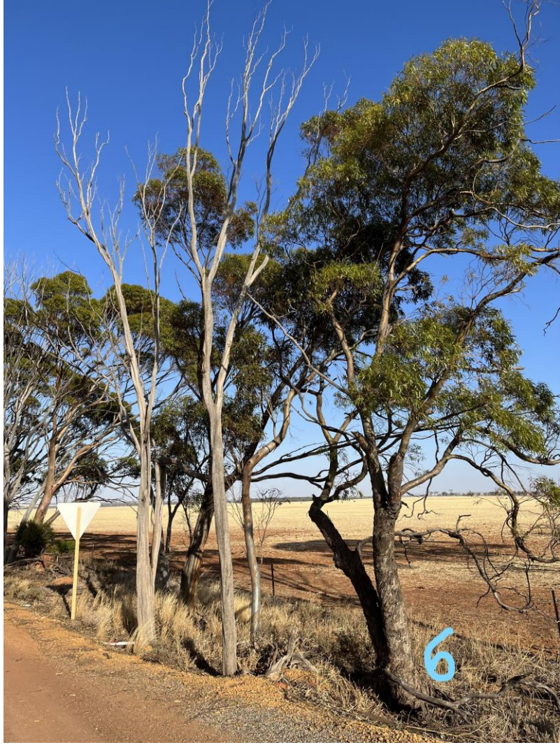
Figure 7. Tree 6