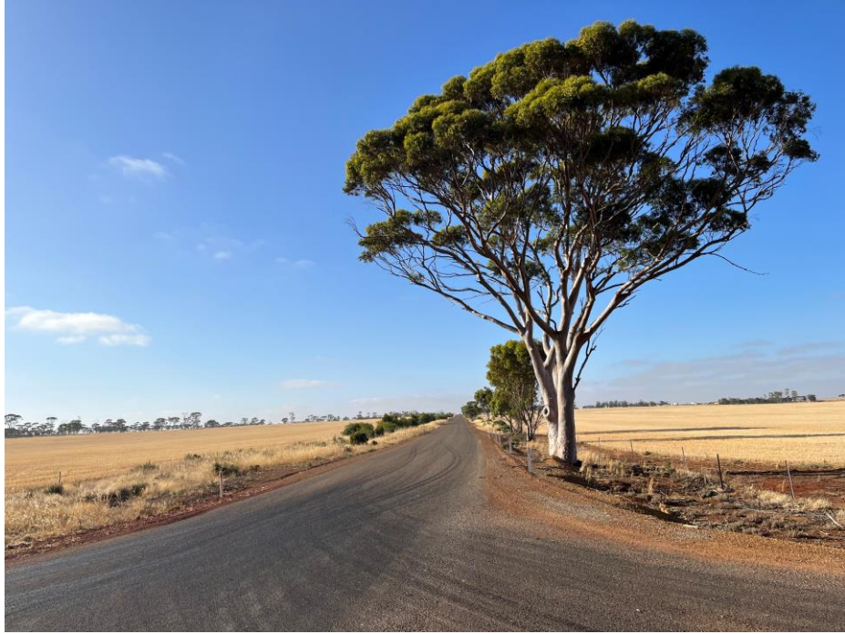
Figure 3. Tree 1 and 2