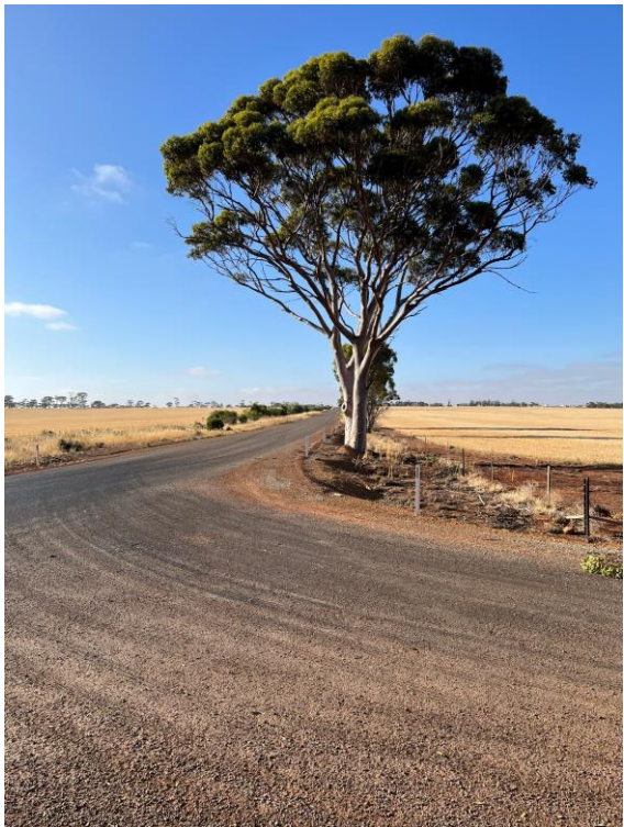
Figure 2. Tree 1