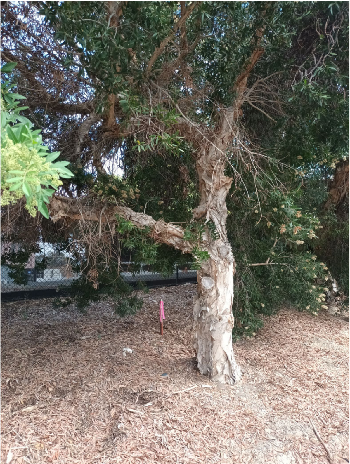
Figure 5 - Tree #2