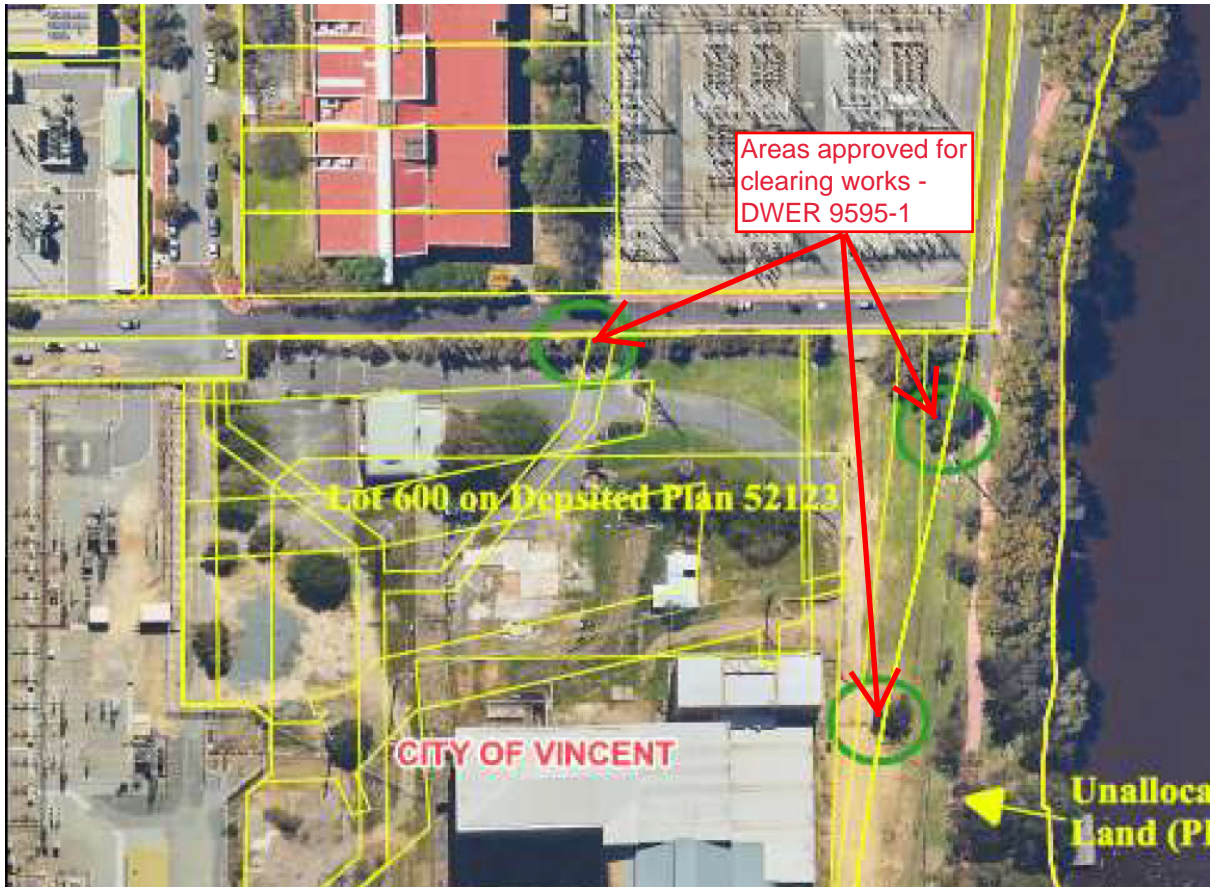
Figure 2 - Extract from DWER 9595-1 - areas approved for clearing