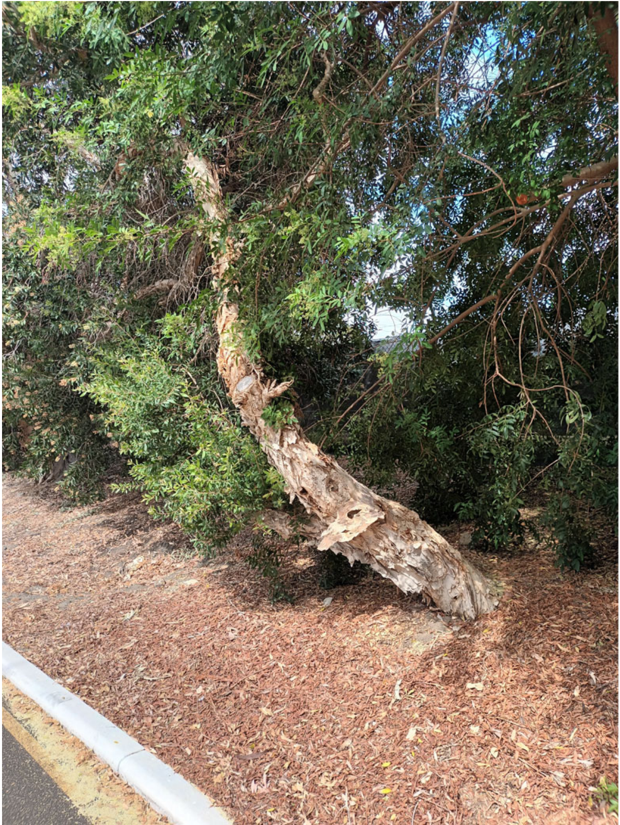
Figure 4 - Tree #1