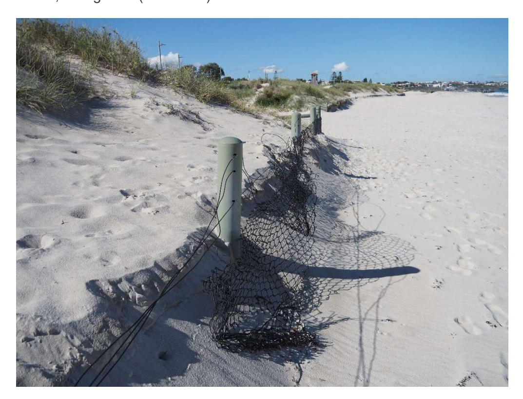
Plate 10: View from the beach side of the dune planned for redevelopment, facing south.