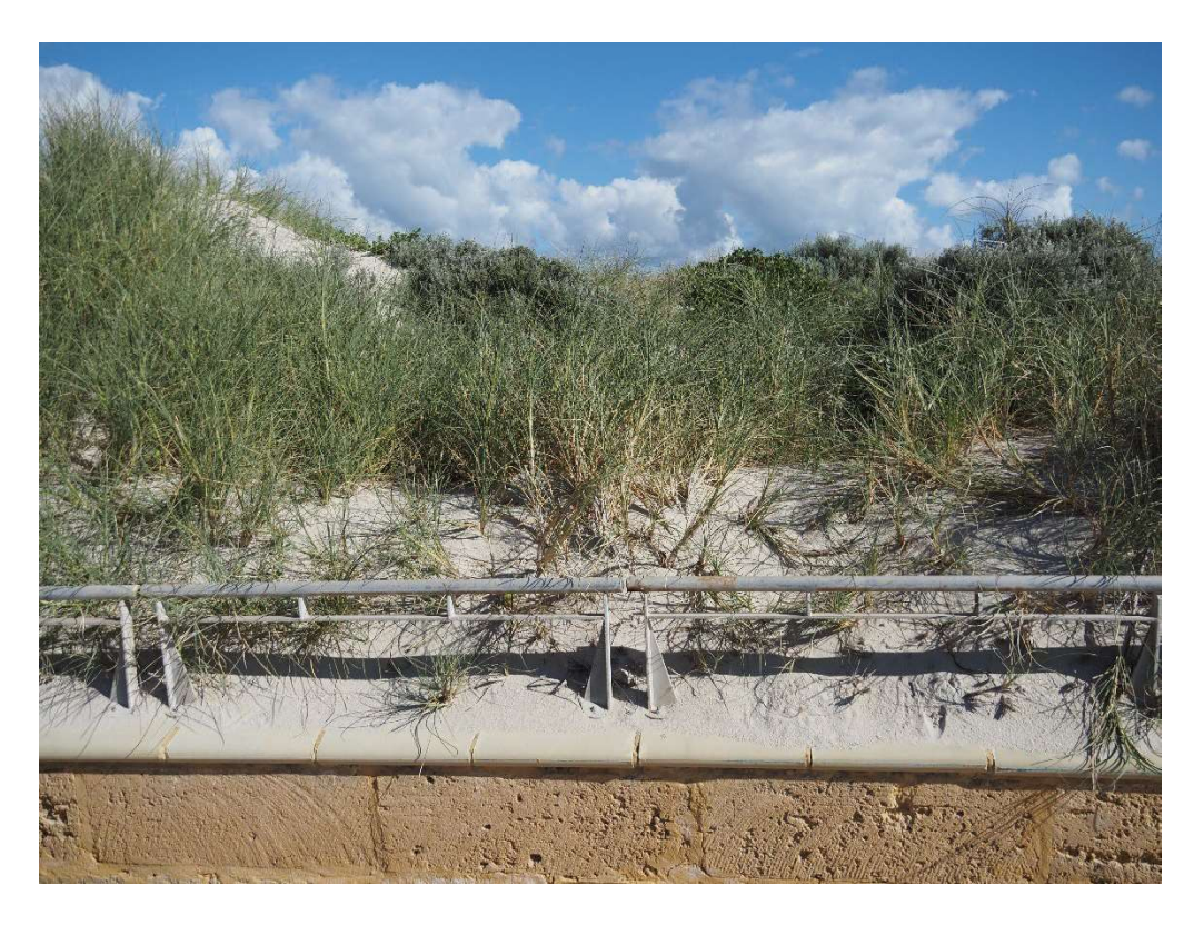
Plate 19: Central view of the eastern side of the dune planned for redevelopment.