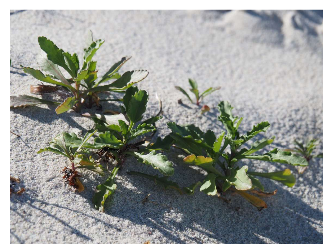
Plate 14: Close-up image of dune species growing.