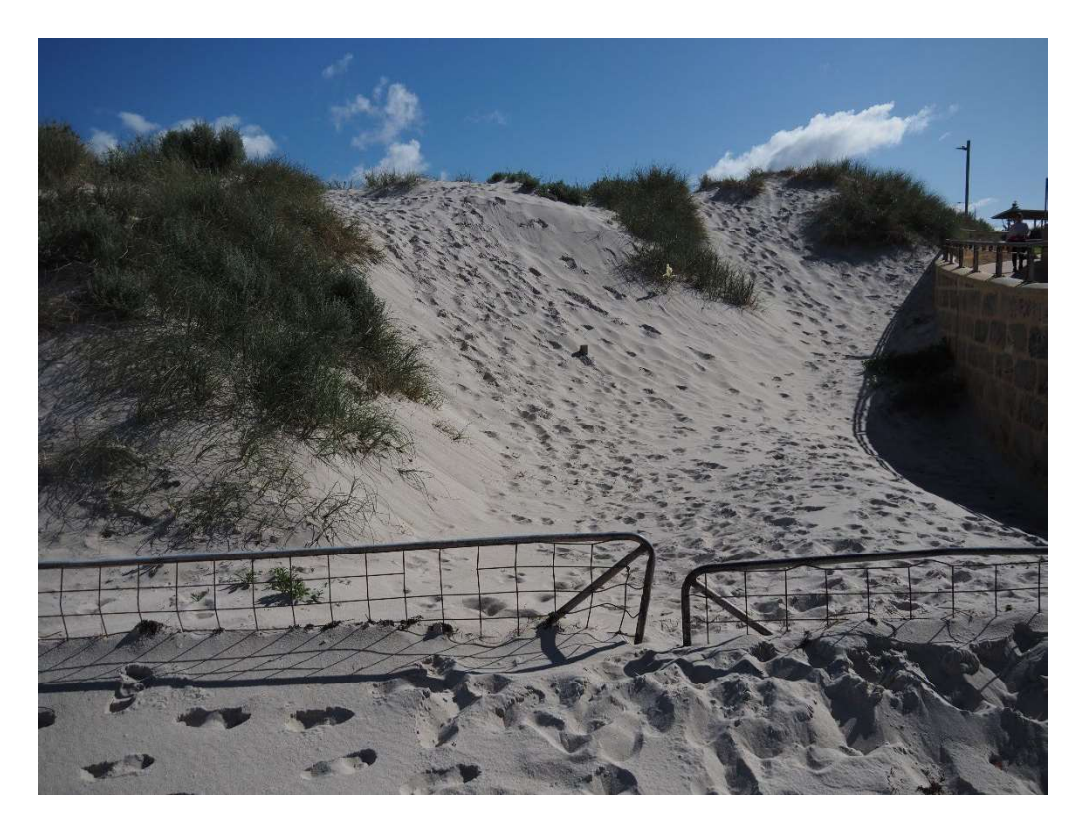
Plate 7: Close up view of south-eastern corner of the dune planned for redevelopment, photo is taken standing on the beach immediate after accessing beach on main access path, facing north, with the circular access path to the north also visible.