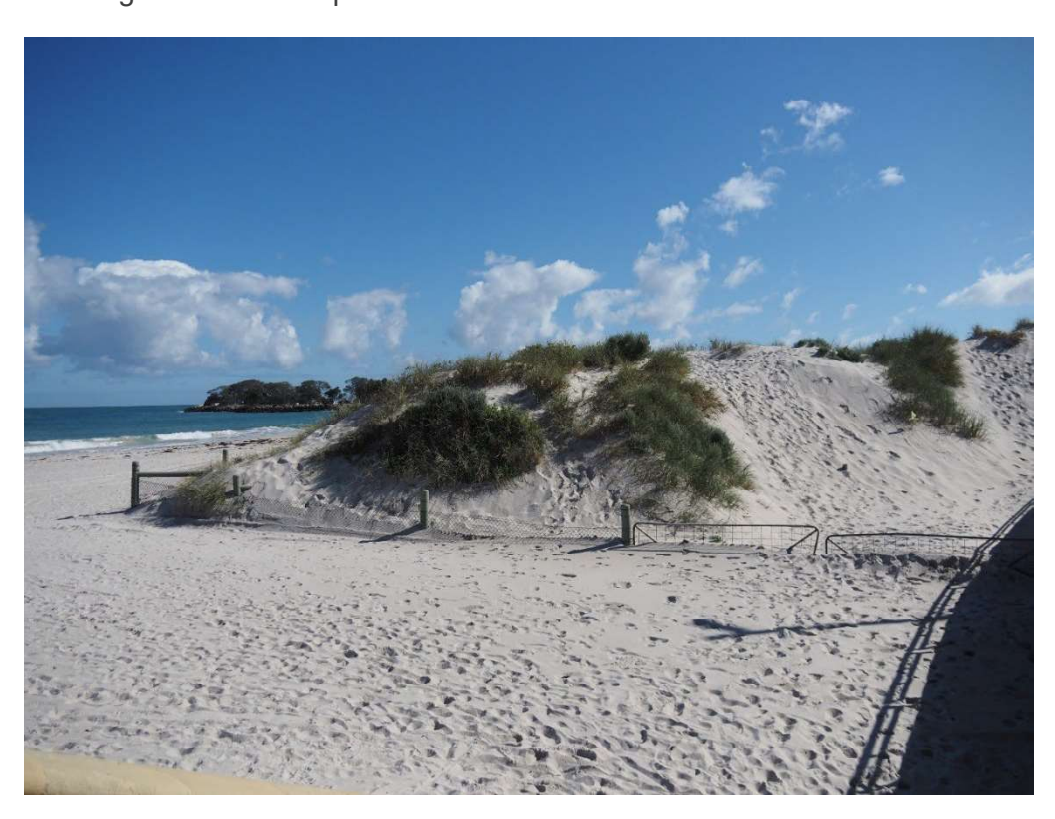
Plate 6: View of southern side of the dune planned for redevelopment, photo is taken standing on the beach immediate after accessing beach on main access path, facing north, with the circular access path to the north also visible.