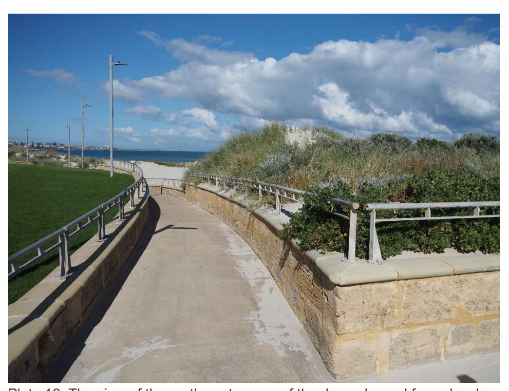
Plate 16: The view of the north east corner of the dune planned for redevelopment.