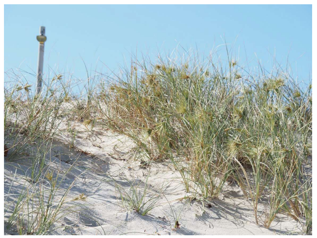
Plate 15: Close up image of the Beach Spinifex, the predominant species growing on the dune system.