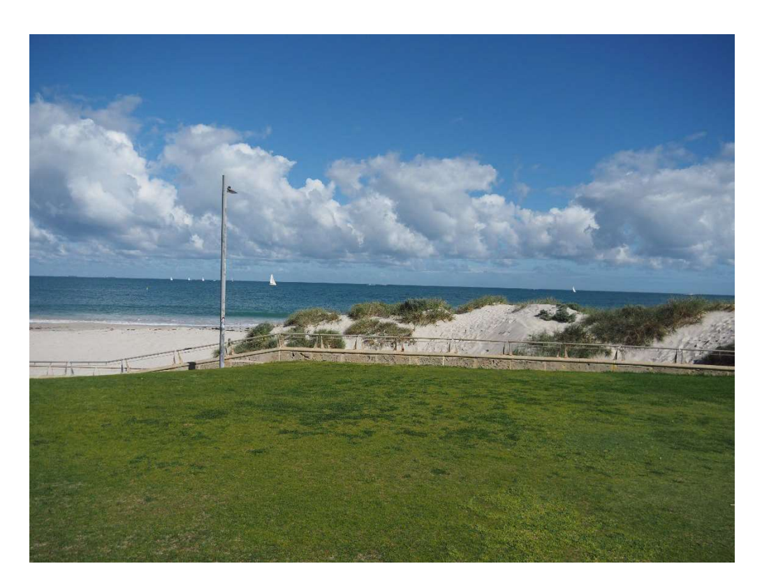
Plate 3: View of the dune planned for redevelopment from the grassed area looking west (towards the ocean).