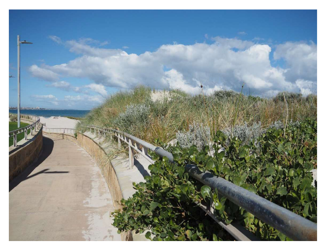
Plate 18: View of the eastern side of the dune, taken from the north-eastern corner looking towards the south-eastern corner of the dune planned for redevelopment.