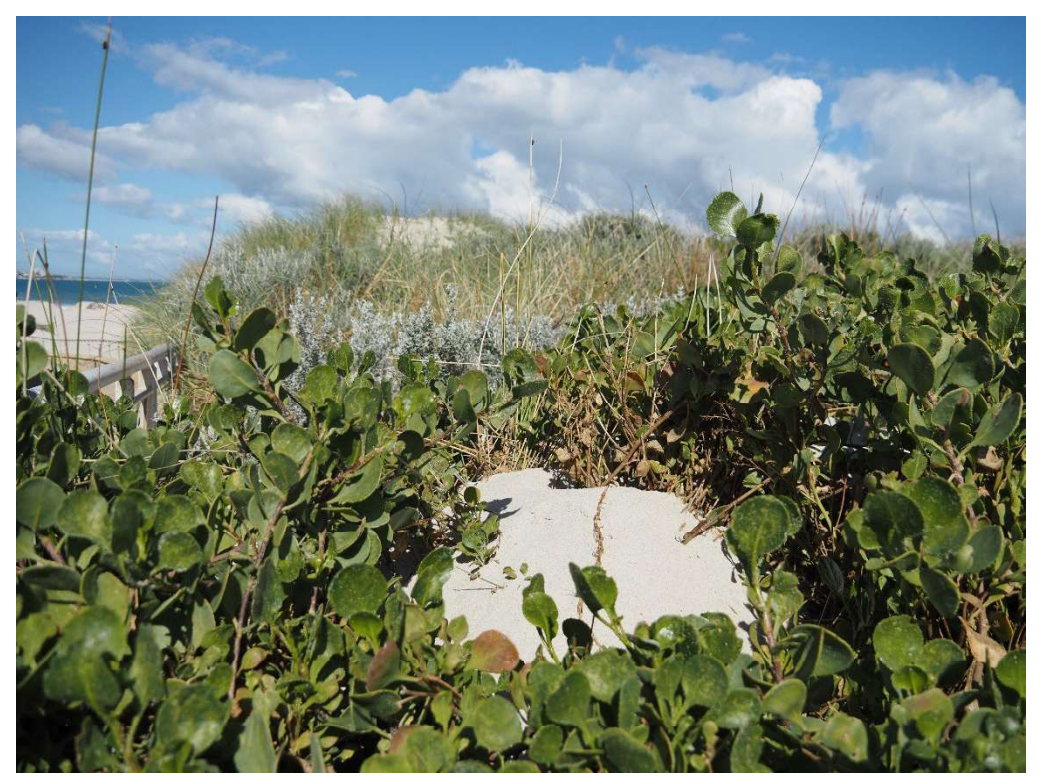
Plate 17: A close up view of the north-east corner of the dune planned for redevelopment.