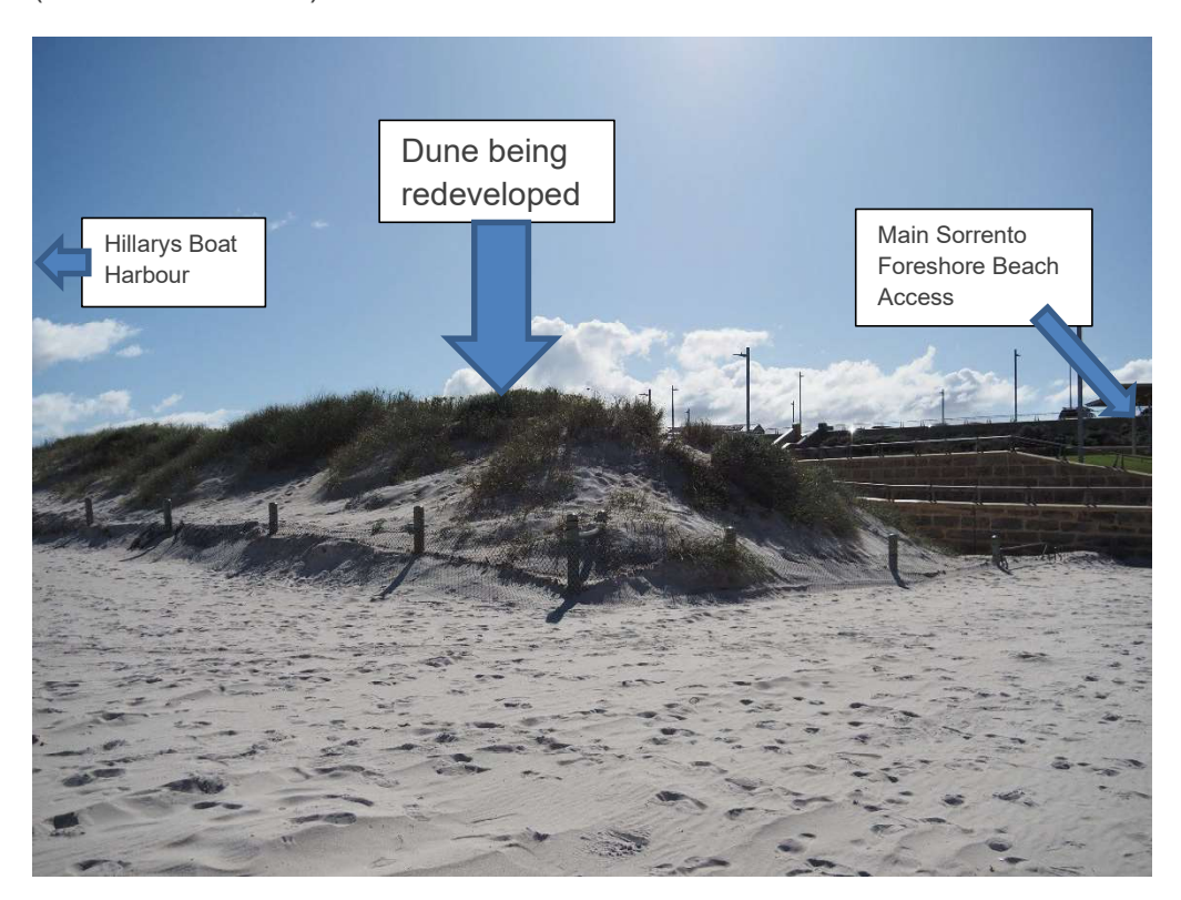
Plate 4: View of the dune from the beach (east) looking at the main access path and dune planned for redevelopment, which will expand the overall area of dune.