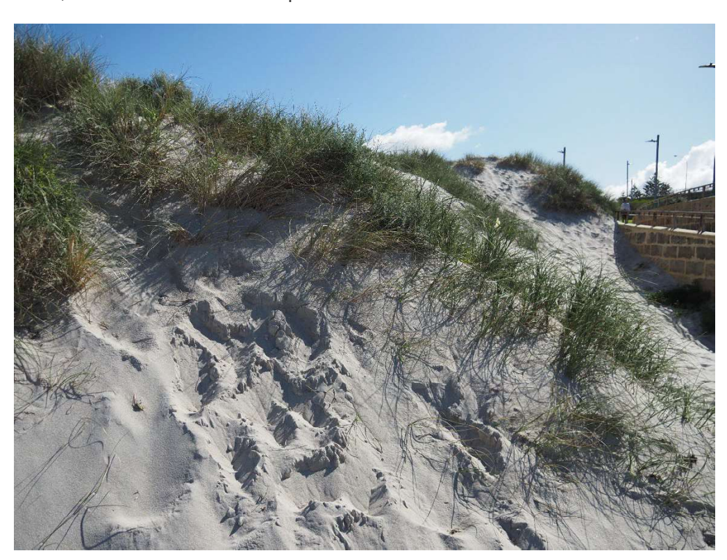
Plate 8: Same view as above image (Plate 7), zoomed in on the dune.