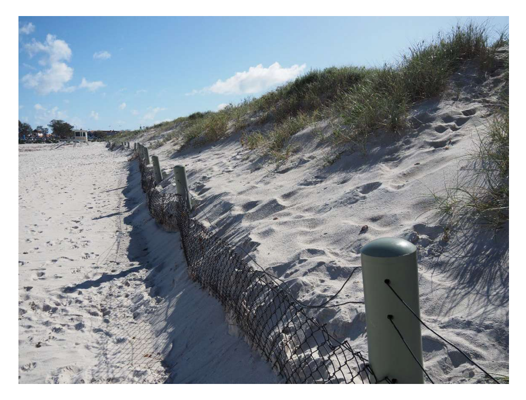
Plate 11: View from the beach side of the dune planned for redevelopment, facing north.