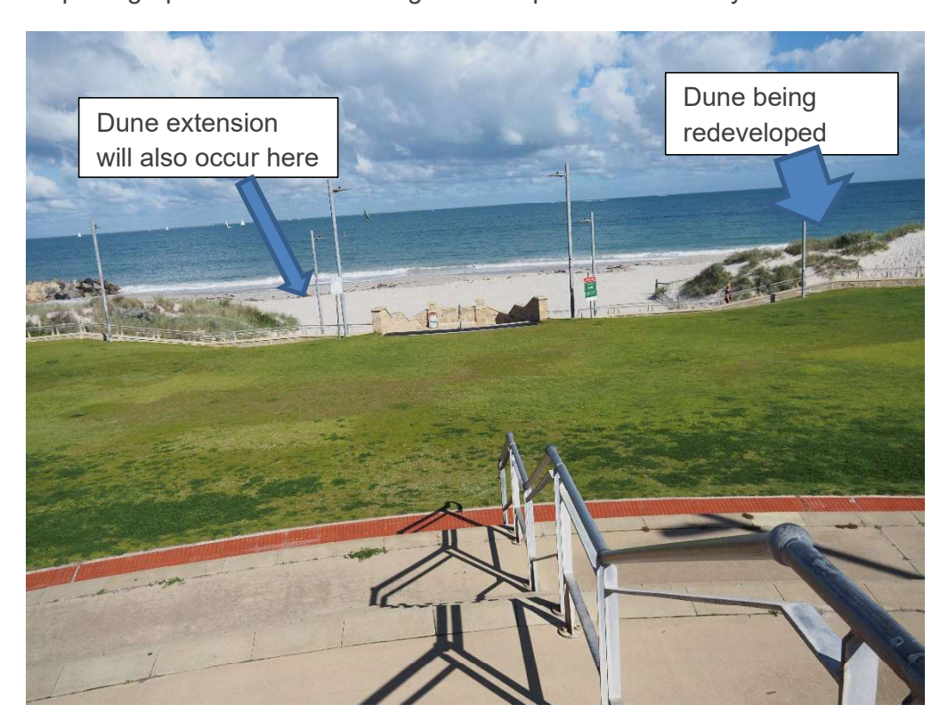
Plate 1: View of the coastline (west) from the car park and main entrance stairs to Sorrento foreshore.

All photographs were taken during a site inspection on 28 July 2022.