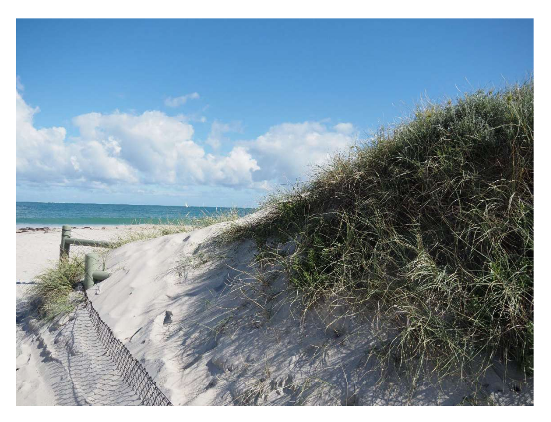
Plate 9: View of the dune planned for redevelopment, view is from immediate after accessing beach, facing west (the ocean).