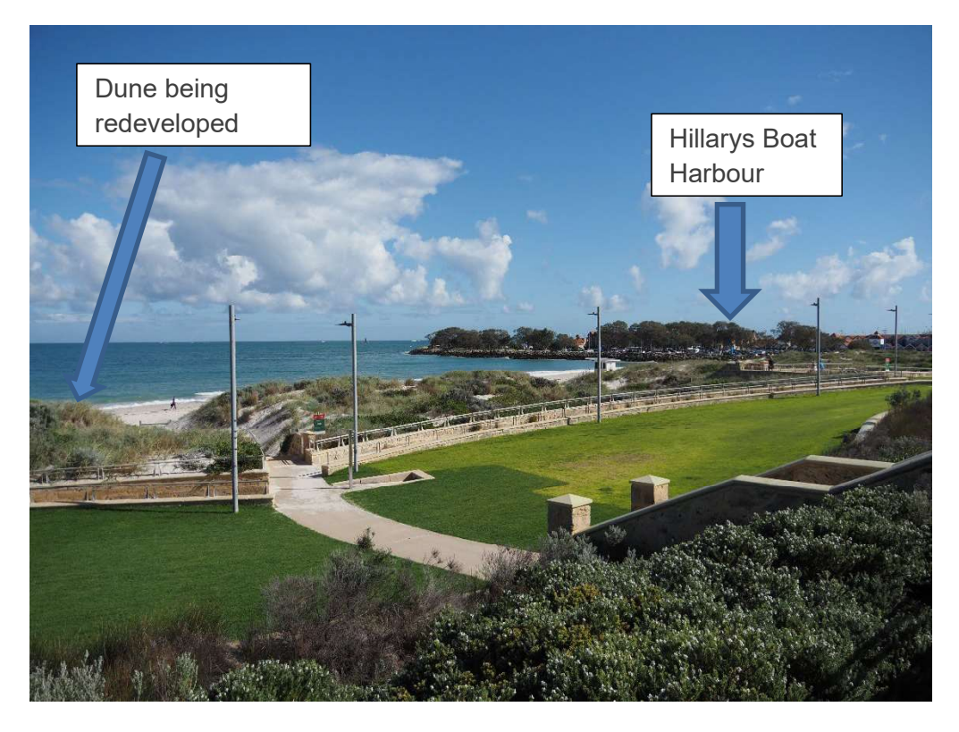
Plate 2: View west from carpark facing slightly north towards the harbour.