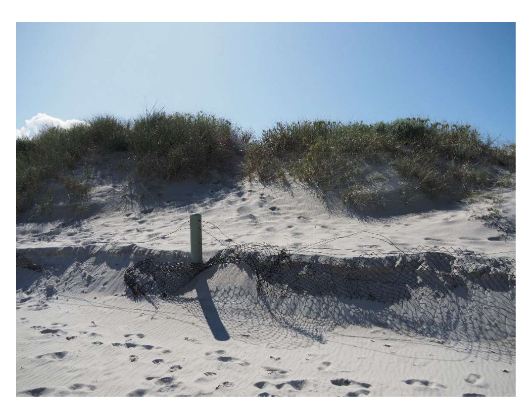
Plate 12: Central view of dune planned for redevelopment, photo taken from the beach looking east.