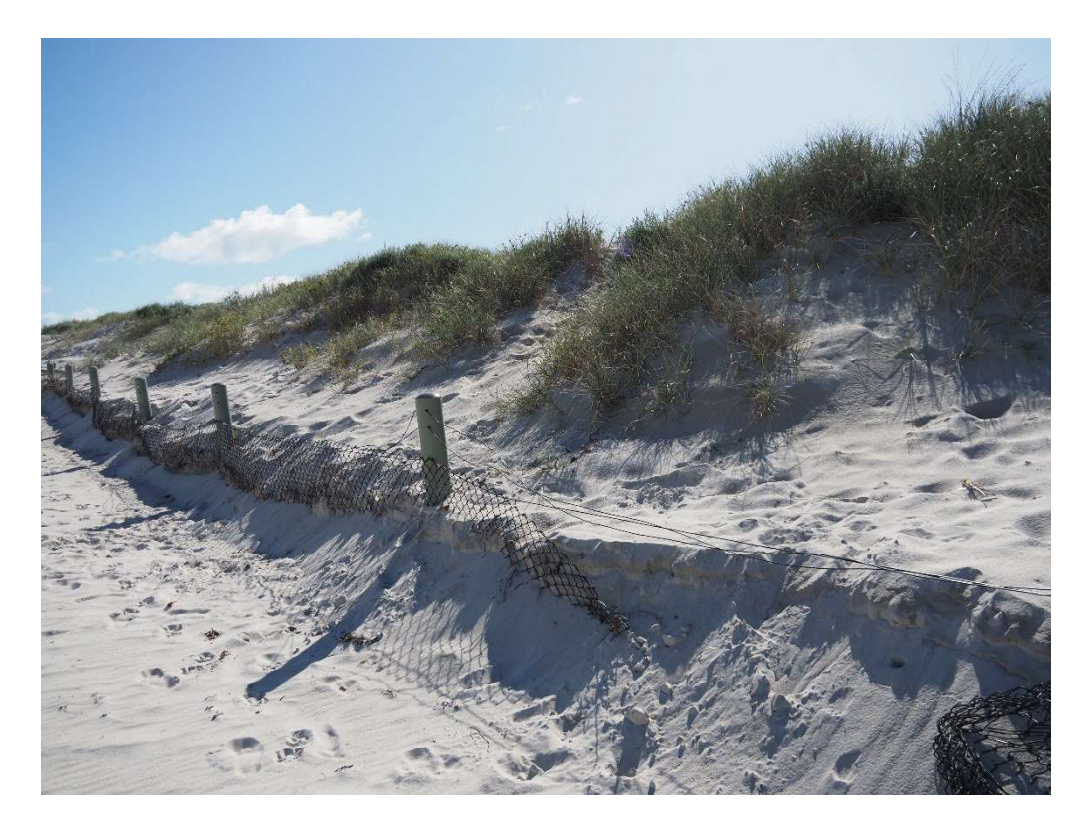
Plate 13: Further view of the western side of the dune planned for redevelopment.