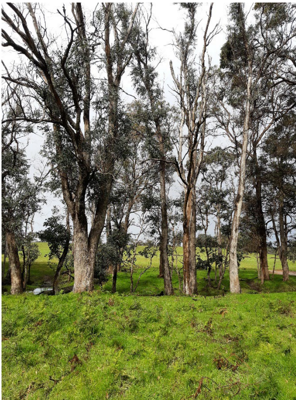
Figure 3. Alignment of road extension across gully with E rudis over grass