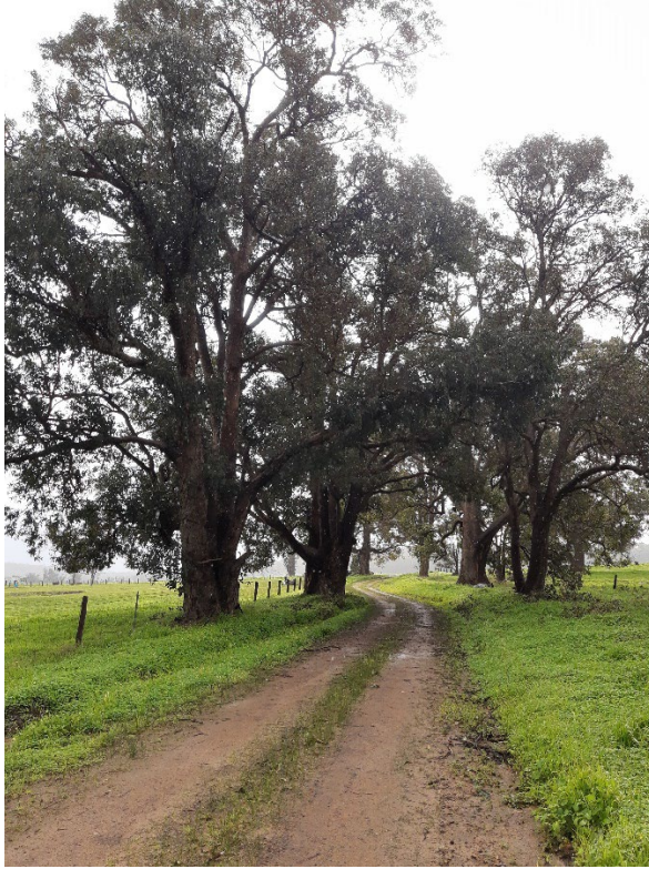
Figure 1. Additional possible Corymbia tree for clearing in made reserve