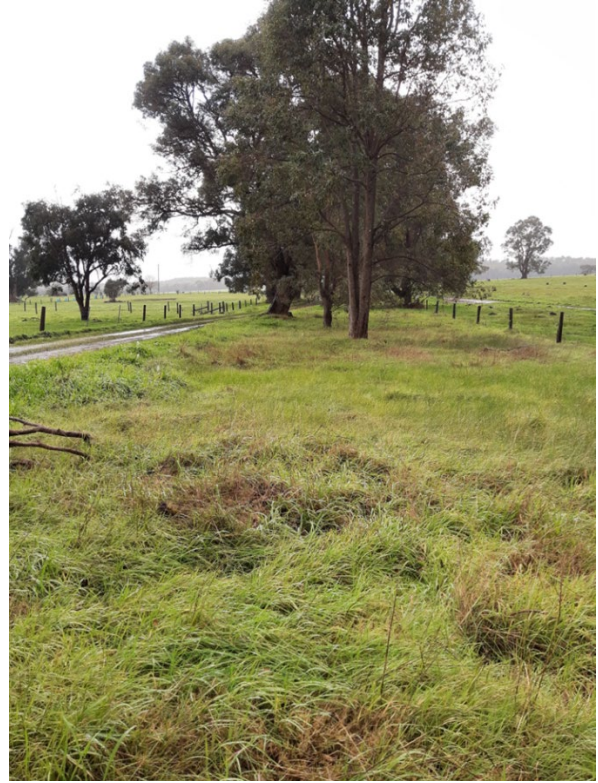
Figure 2. Isolated Corymbia tree in existing made road reserve with grass understorey