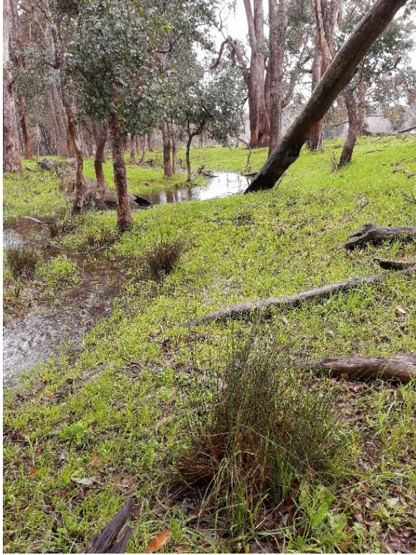
Figure 5. Isolated Juncus clump on area of proposed crossing